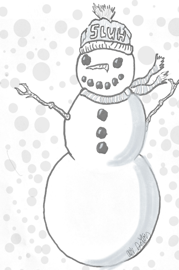
art | Alex Dieters

In the event of another snow day in the future, classes will be held synchronously via Zoom.