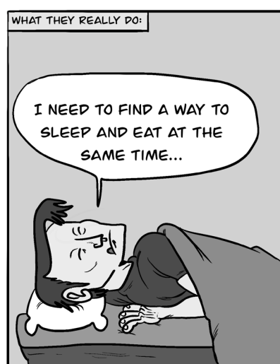
SLUHsers | Jude Reed