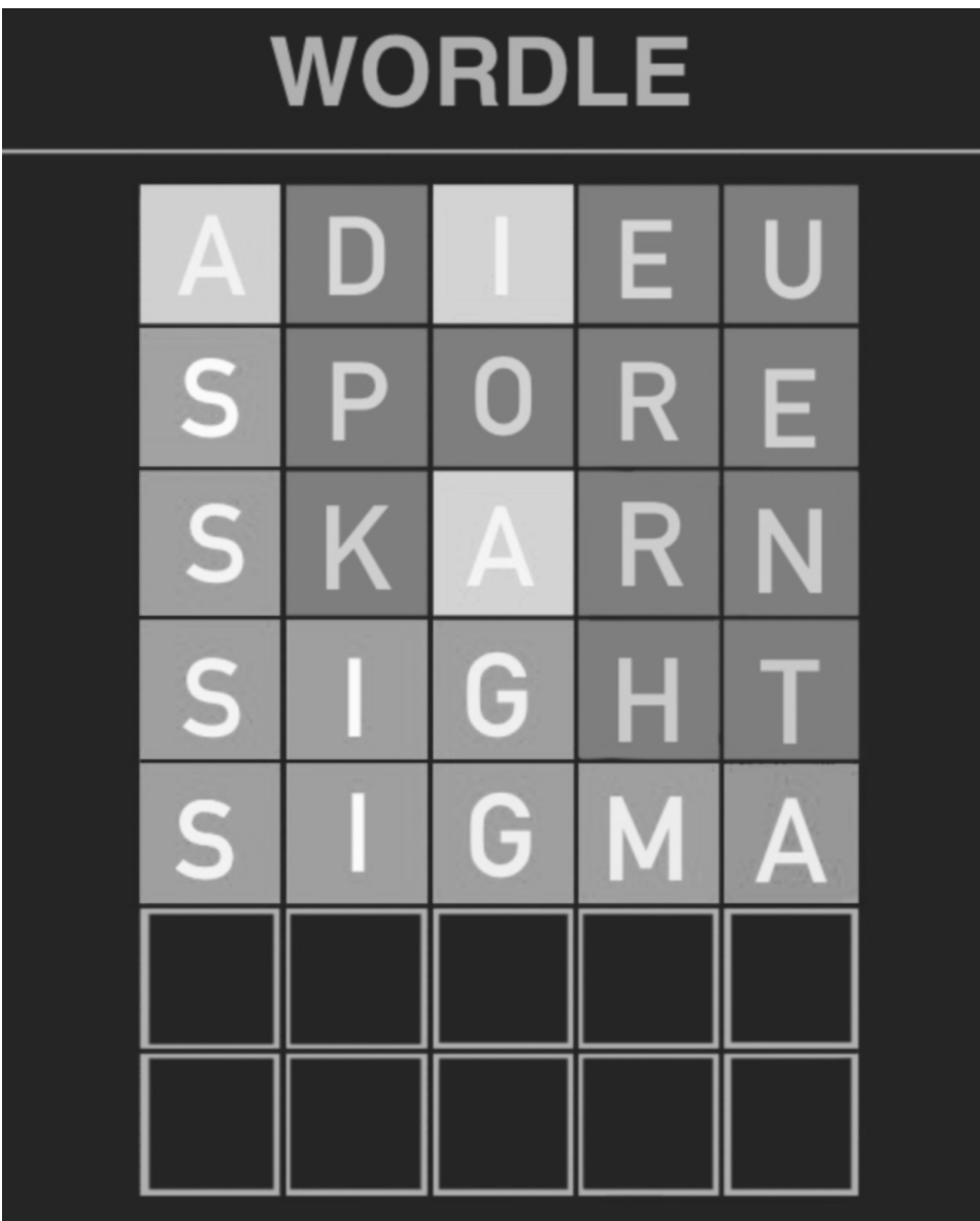
art | Will Blaisdell

Most importantly, Wordle is a ritual. People can return to it every morning and escape their busy lives, even for just a moment. From adieu to zebra, the small satisfaction of guessing a random word on only the second or third try is just what someone needs to get through the day.