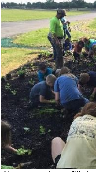
Above, students fill the creating a natural filteri Fork Mill Creek.

<u>Click here to view a brief video</u> from the ribbon cutting ceremony produced by West Chester Township.