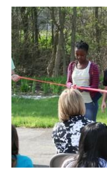
A community dedication Elementary students So Gerlaugh join Principal (