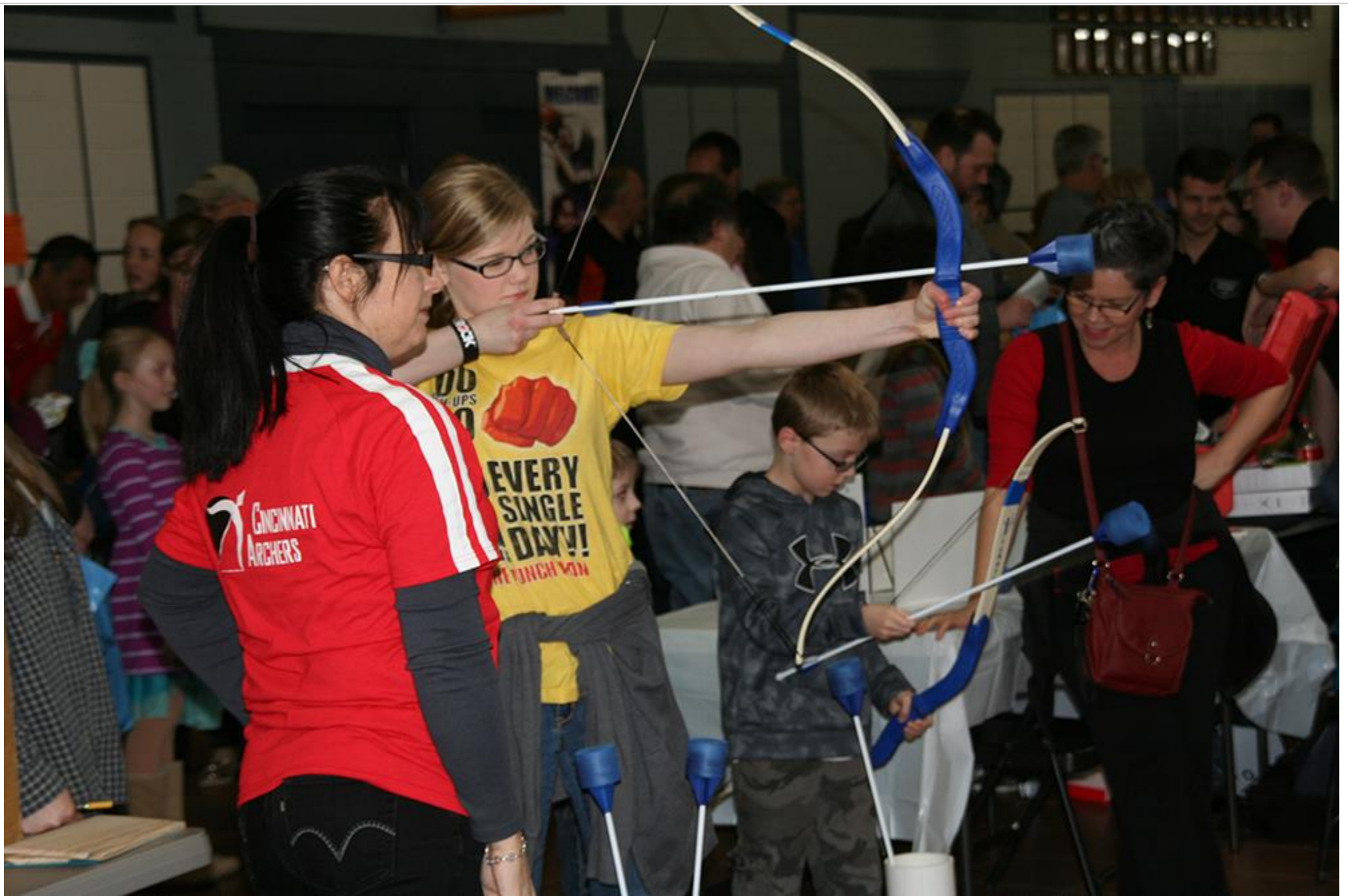
Summer Fun Fair 2017 Was a Hit