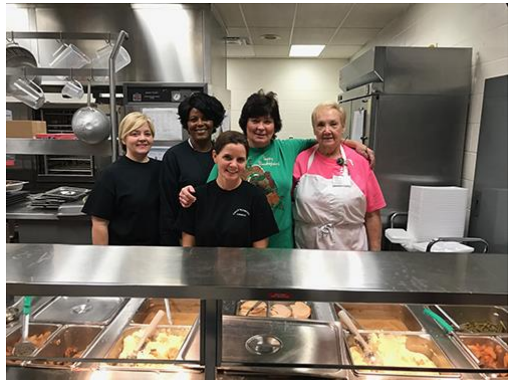
The cafeteria team at Adena Elementary celebrates their annual Thanksgiving lunch. Support positions are among the many employment opportunities being featured at Lakota's Job Expo.