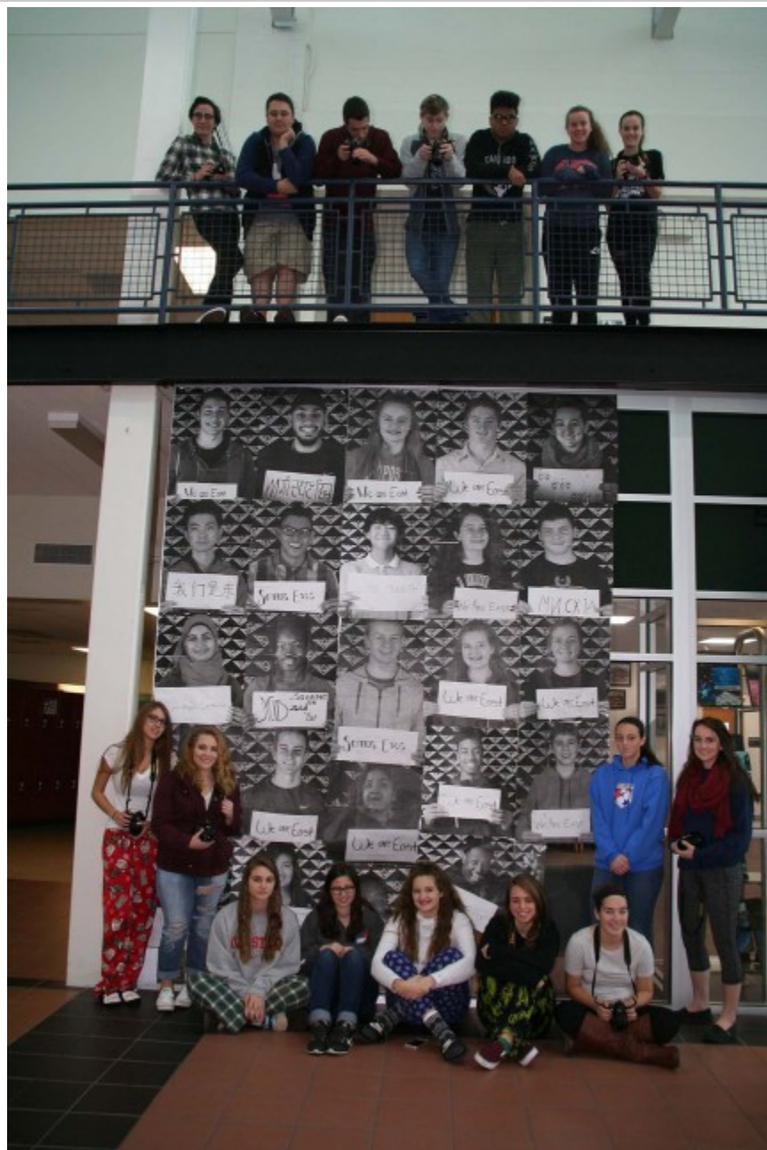
Lakota East photography students pose with the school's recent exhibit, "We Are East," which focuses on the commonalities of students as well as their diverse backgrounds and cultures.

The art exhibit features 24 images and 11 languages yet there is one overall message – “We are East.”