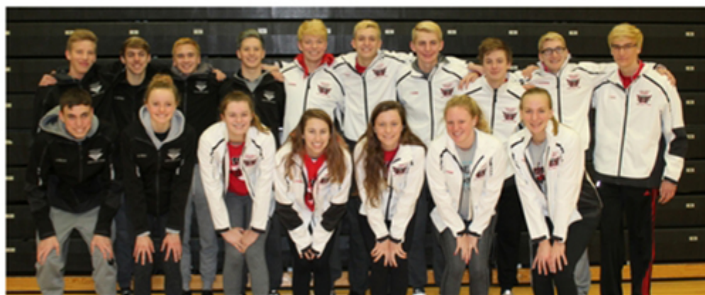
State-bound Swim Team