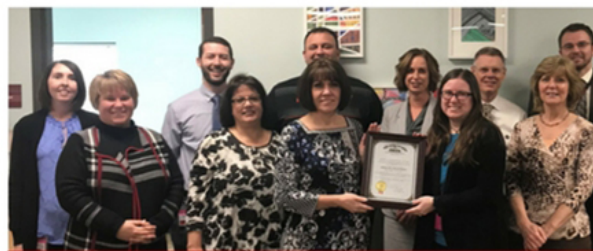
Auditor of State Award