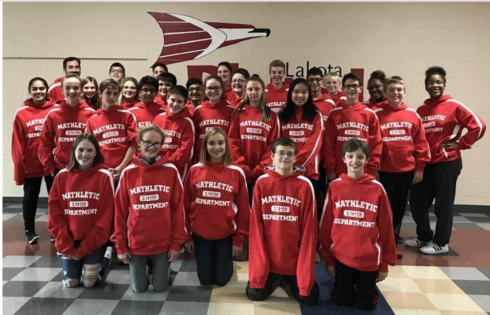
'Mathletic Department' Largest in Plains Junior History