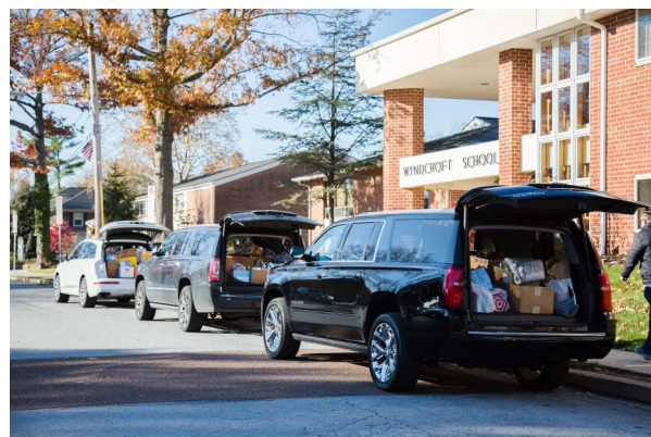
Pictured above are three SUVs packed with our donations.

Wyndcroft's motto is Non Sibi, which is Latin and loosely translates to "Not for oneself but for the good of others." A Wyndcroft education is infused with the spirit of this motto, both inside the classroom and in the way students embody it in their everyday lives. Each year, Wyndcroft partners with the Pottstown Cluster on an All-School Non-Sibi Holiday Cheer event, including food, toys, bedding and monetary donations. The year, The Wyndcroft community donated 992 pounds of food and goods, as well as $680 to the Pottstown Cluster.