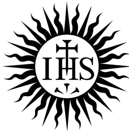
Seal of the Society of Jesus

The Georgetown Prep student at graduation has acquired considerable knowledge of the many needs of local, national, and global communities and is preparing for the day when he will take a place in these communities as a competent, concerned and responsible member. The graduate has been inspired to develop the awareness and skills necessary to live in a global society as a man for and with others. Although this commitment to doing justice will come to fruition in mature adulthood, some predispositions will have begun to manifest themselves.