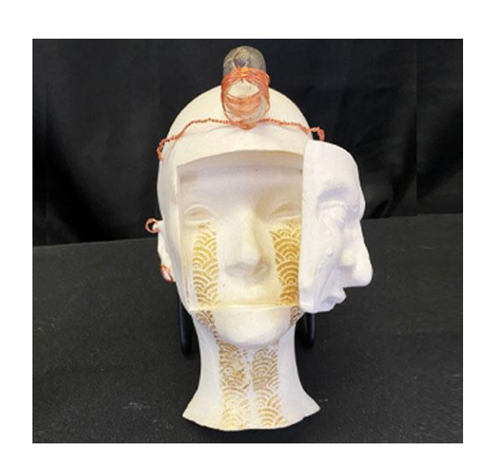
JAKE QUINLIN '21 Sculpting & Metalwork