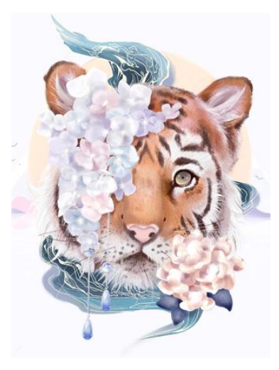
Qinyue (YuYu) Huang Tiger and Flower