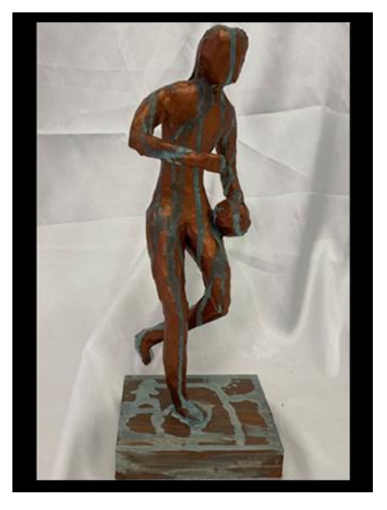
Jaya Michel Figure in Motion