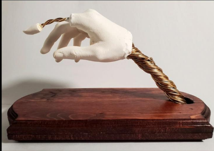
Jake Quinlan '21