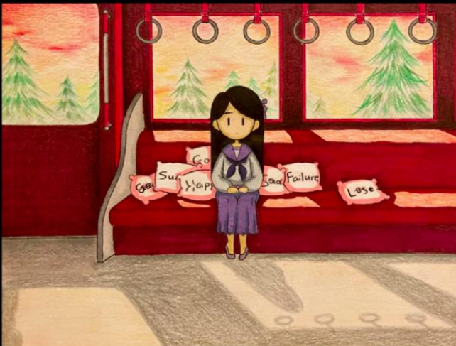
Xiang (Lucy) Chang '21