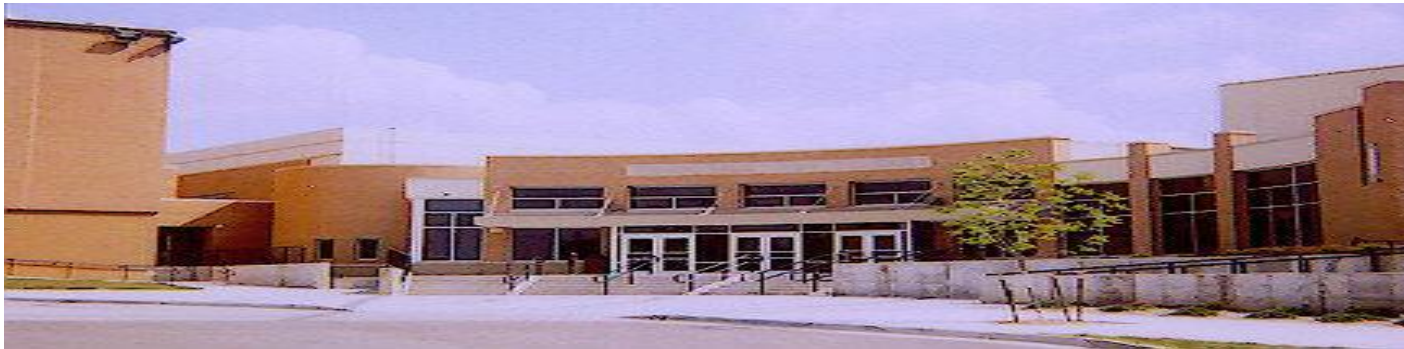
Park Hill High School