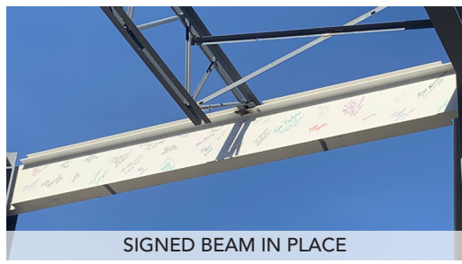
SIGNED BEAM IN PLACE