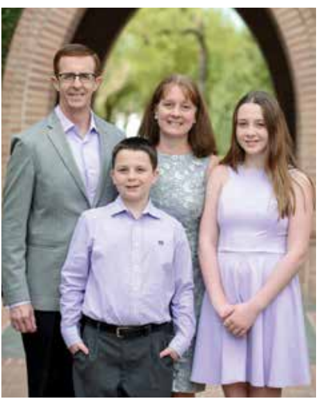
The Doerr Family