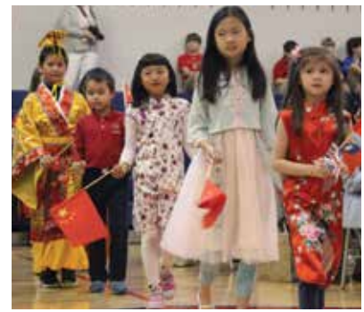
Heritage Festival Closing Ceremonies