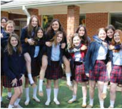
Girls from the Class of 2020 enjoying lunch in the courtyard on Ash Wednesday