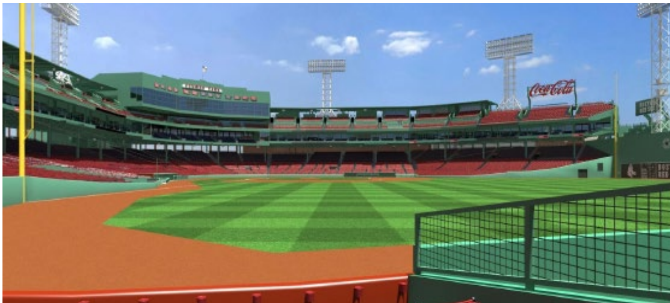
Right Field Box, Rows H-M