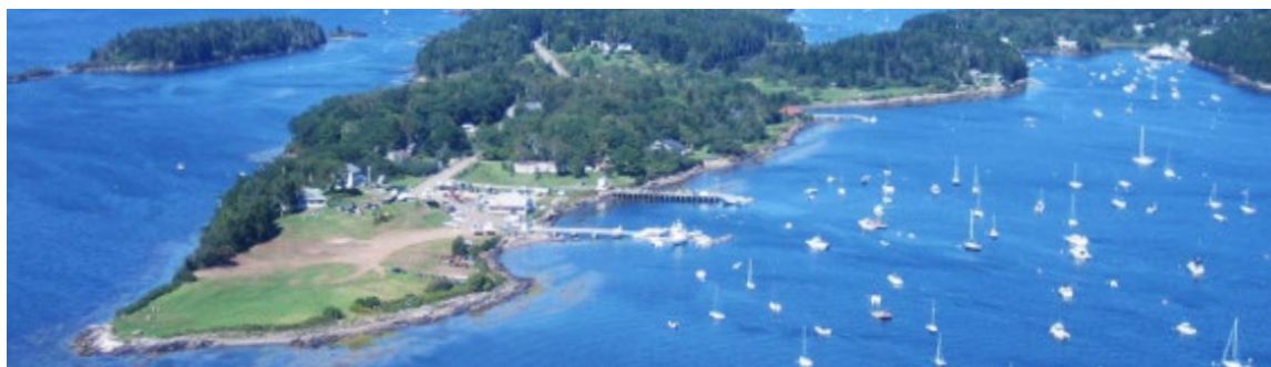
Dolphin Marina | Harpswell, ME