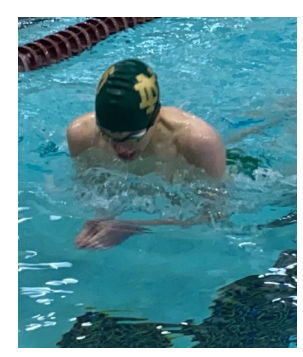
The Notre Dame Boys Swim team continued to show drops in times in its latest meet against Huron Valley