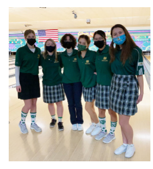
The Notre Dame Girls Varsity Bowling team finished in the top-eight at the Oakland County tournamnt