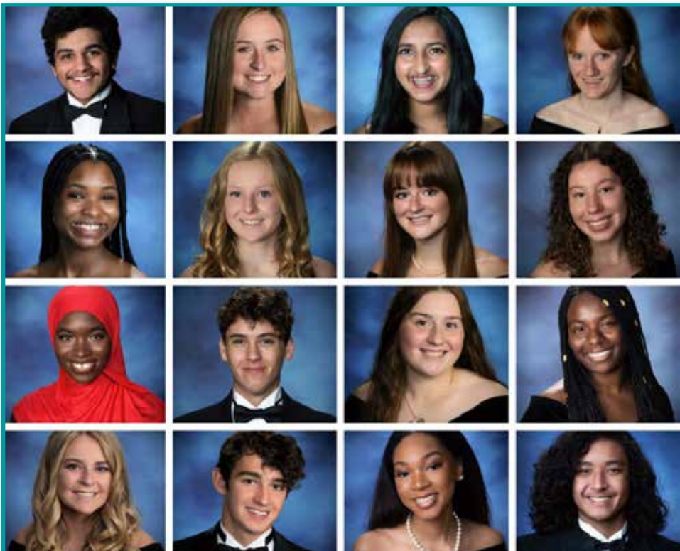
Pictured are the valedictorians and salutatorians for the Class of 2021. Read more about these class leaders on Page 32.