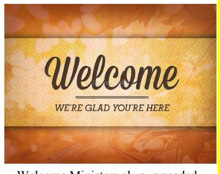
Welcome Ministers always needed at all Masses!