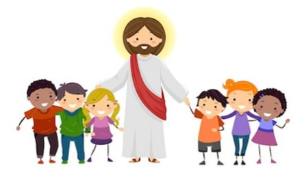
CCD PK – 6 Sundays 9:00am to 10:15 am 7 & 8 Mondays 6:30 pm

Grief Support Group Sundays at 2PM in the school Library GREFASHARE Help and encouragement after the death of a spouse, child, family member, or friend.