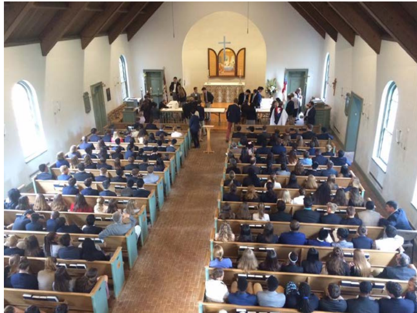
Honor Code signing 2017

On my honor, I will not lie, cheat or steal and I will report anyone I witness doing any of the three.