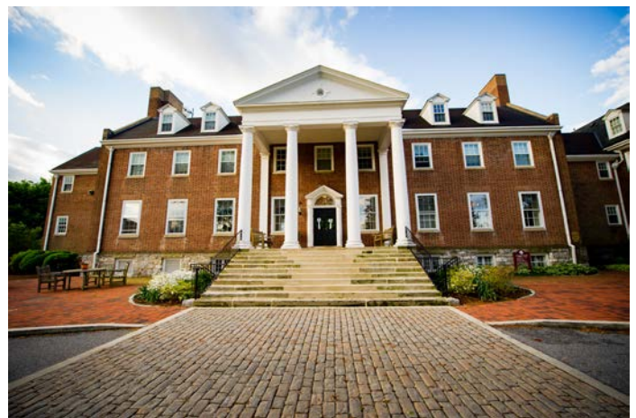
Claggett Dormitory for boys