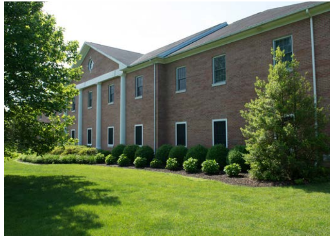
Holloway Dormitory for girls

Non-fire emergency communications are dispatched campus-wide through an Alertus® notification system. Alert beacons are located strategically throughout campus buildings. Beacons utilize both audio and visual means of notification. Students should familiarize themselves with the location of each beacon in each campus building. If an alarm is activated, students should follow the instructions that will be displayed on each beacon.