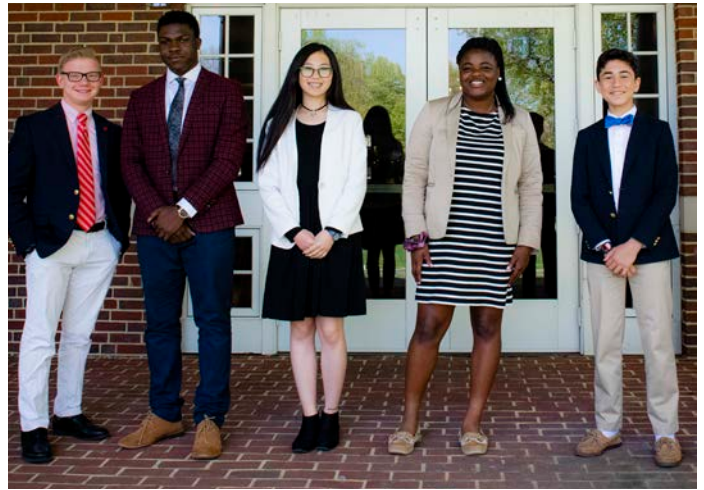
Formal school dress

As clothing styles are constantly changing, it may be necessary to adjust the dress code during the school year. These changes will be announced and posted in the Saint James Handbook.