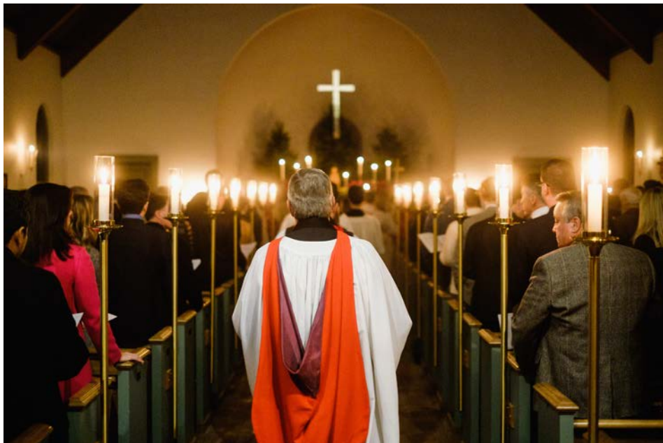
The Saint James Chapel

(680, The Hymnal 1982; The Episcopal Church)