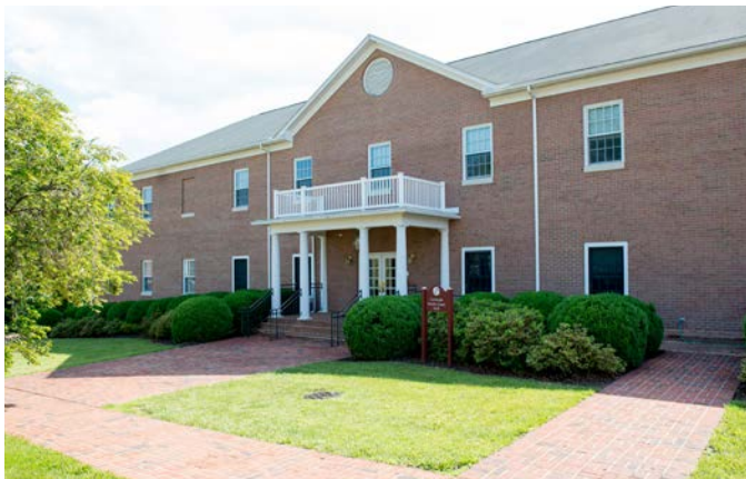
Coors Dormitory for girls

BOARDING STUDENTS must be on their halls Sunday through Thursday at 10:00 p.m.