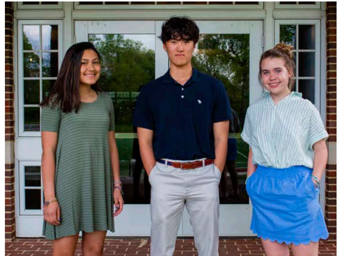
Modified school dress