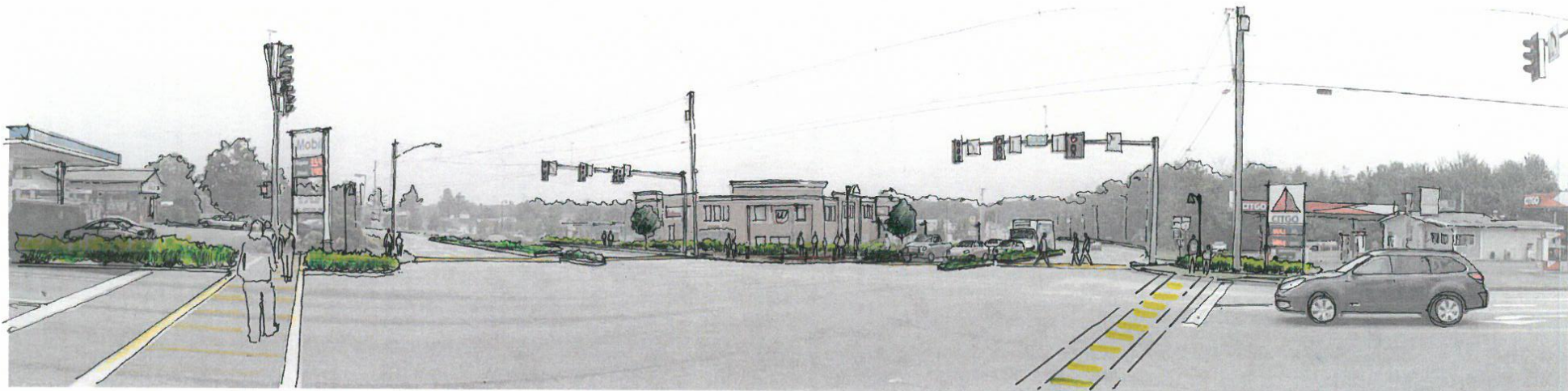
Oak Hill Intersection Ground Level and Aerial Perspectives