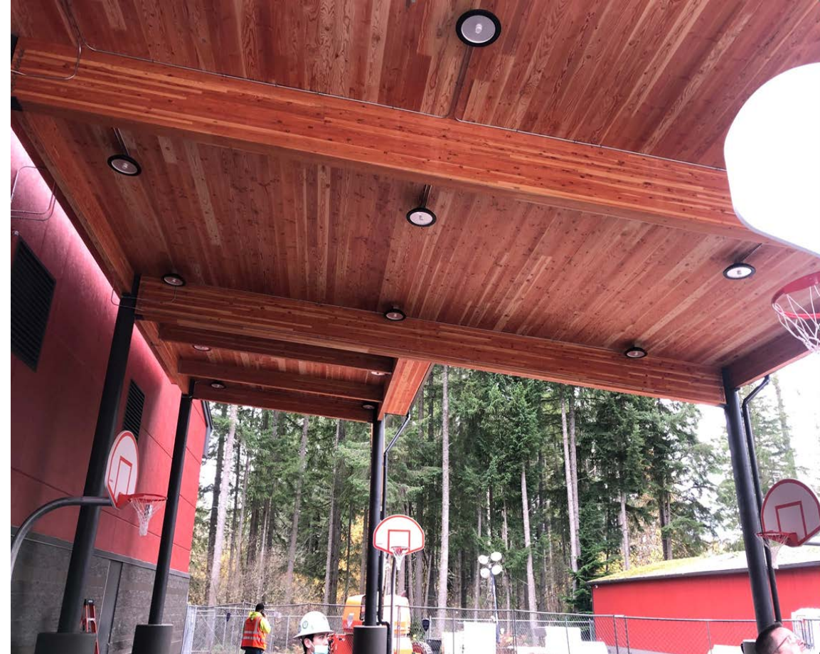
Covered Play Area nearing completion