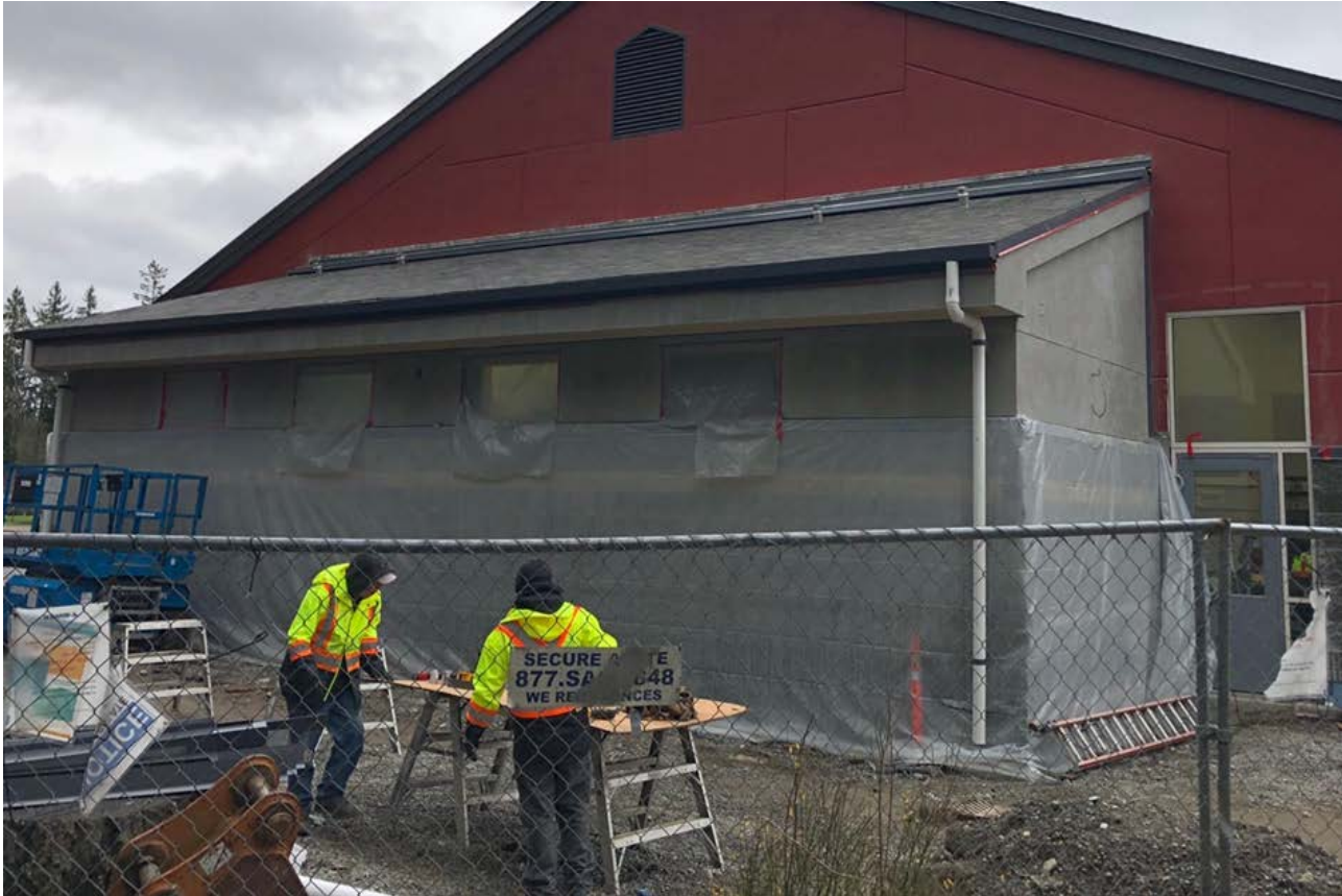
Music Storage Room roof and exterior finishes well underway.