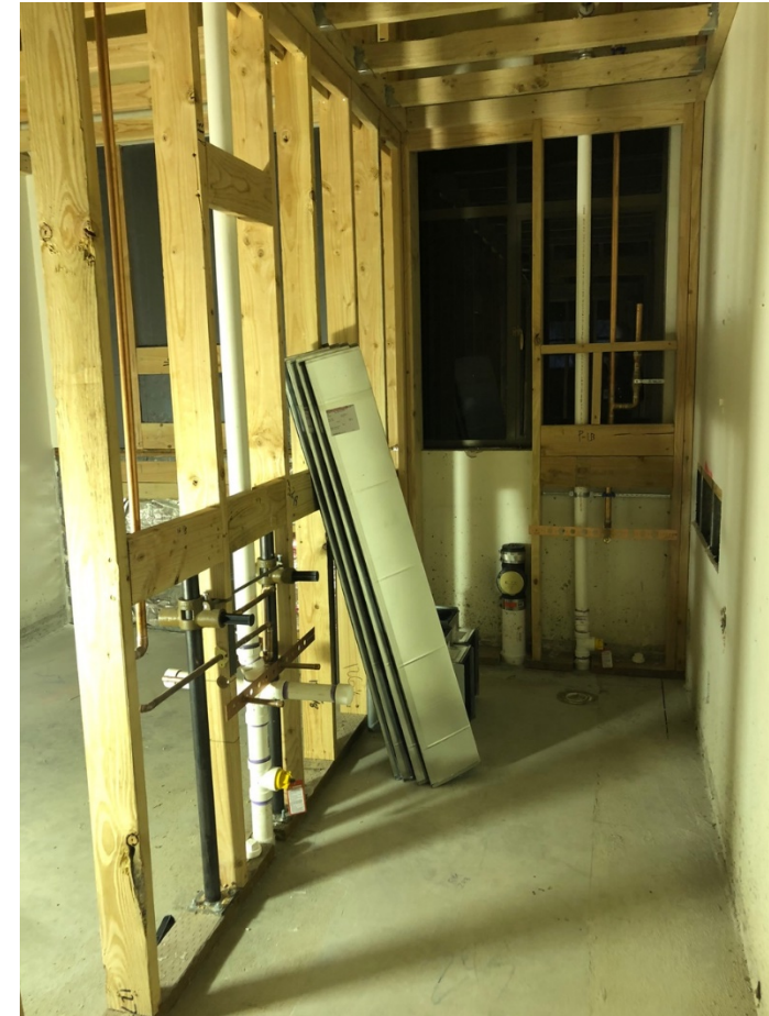
Plumbing and framing well underway.