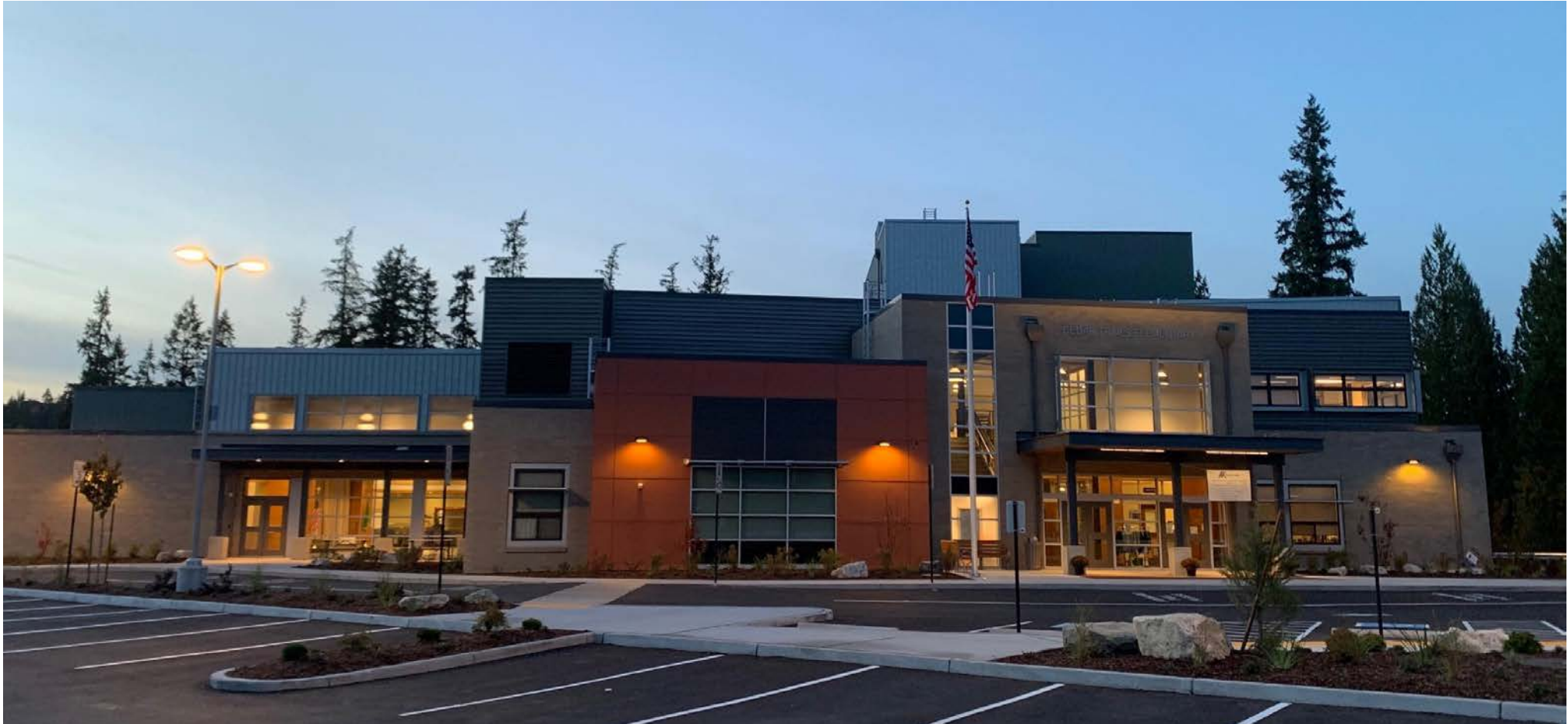
View of main entrance to the building