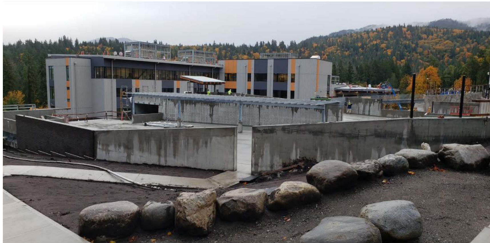
View from the corner of Talus Drive and Falcon Way with the parking garage in the foreground and the main building in the back.