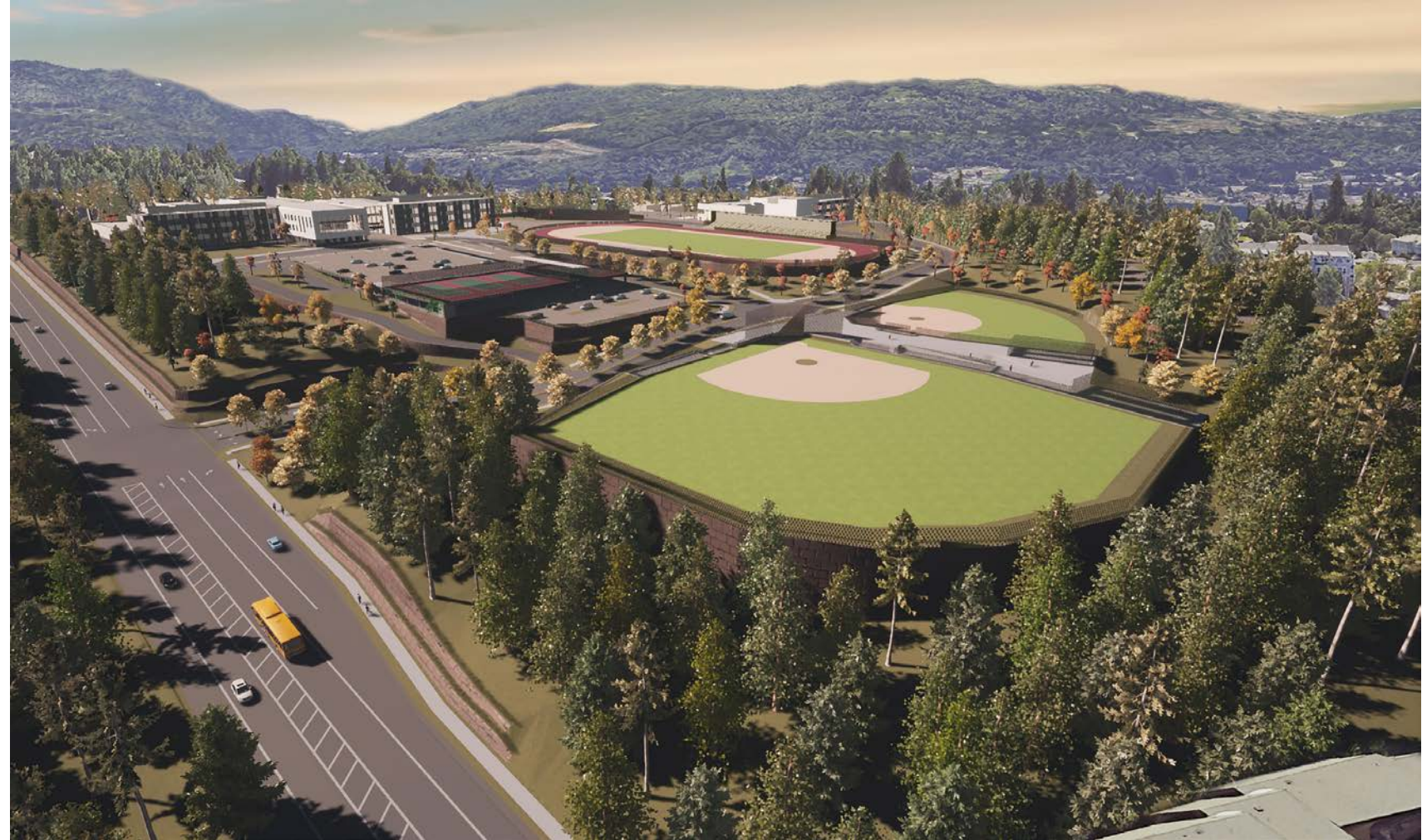
Updated rendering of the site looking to the Southwest.