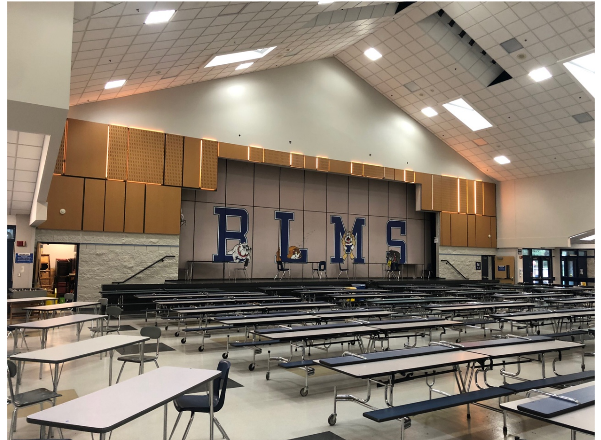
New finishes and acoustical panels being installed in existing Commons.