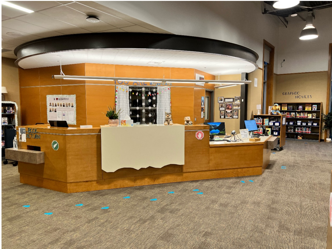
Library Circulation Desk