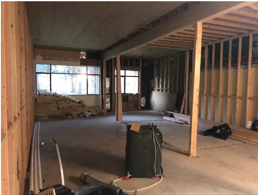
Installation of underground plumbing complete and framing underway