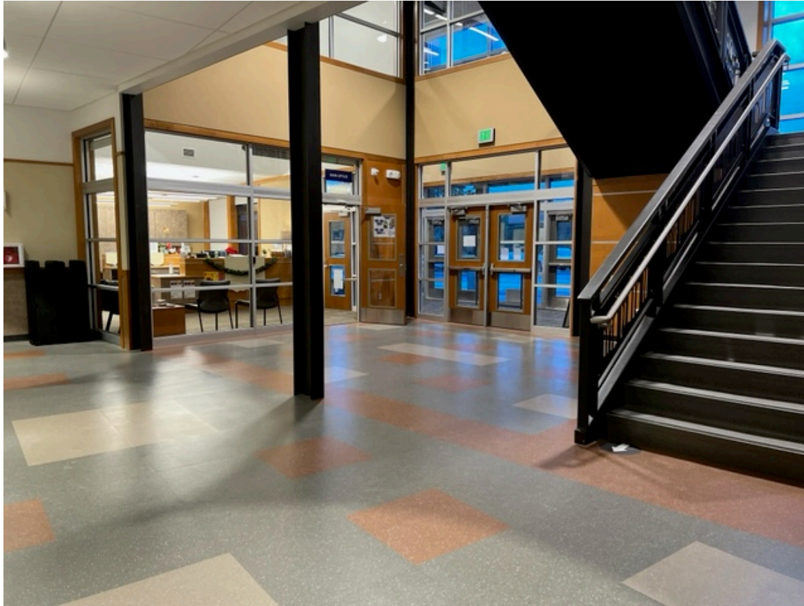
Main Entrance area