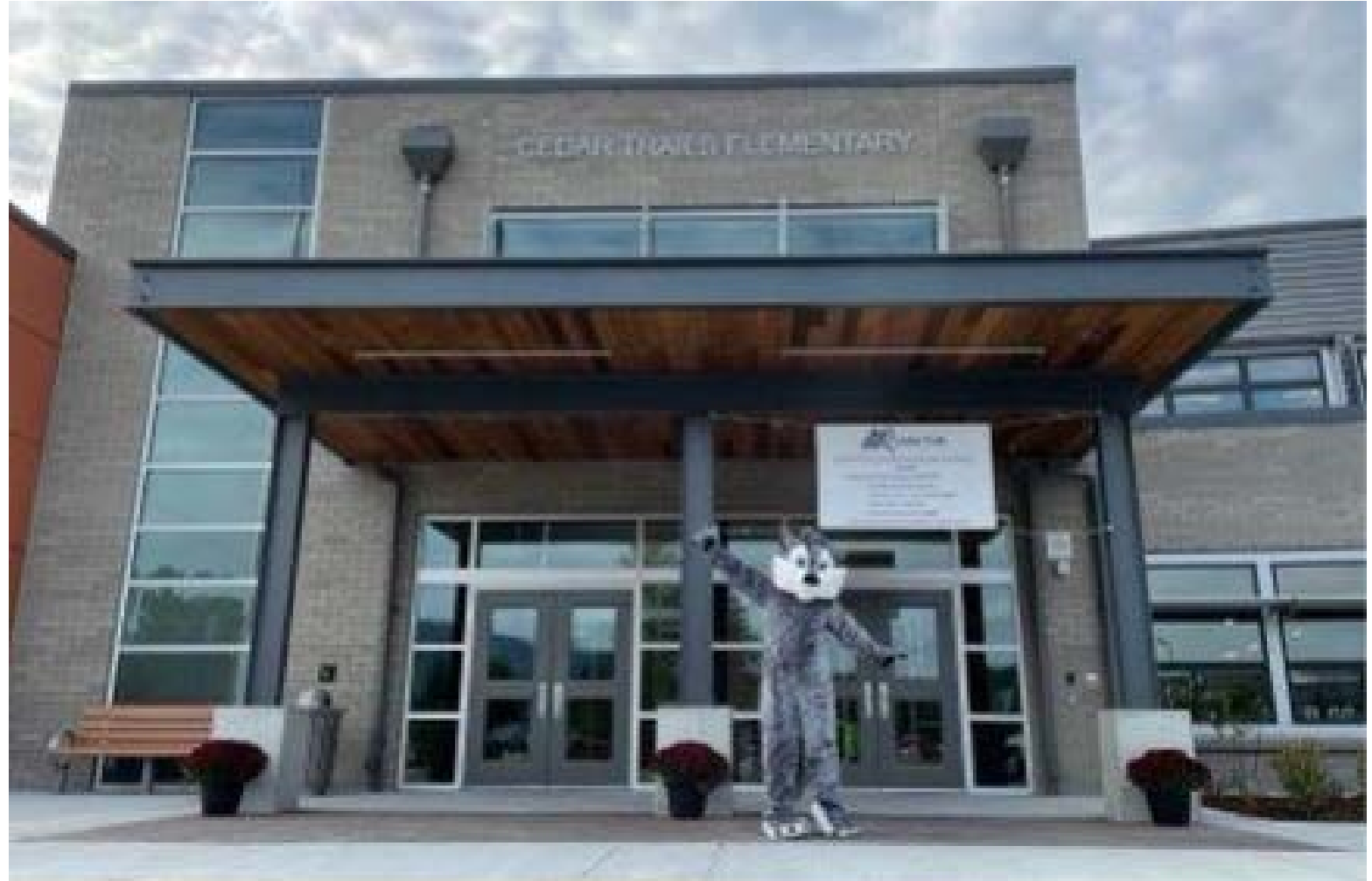
Cedar Trails wolf mascot greeting everyone and welcoming them to the new building!