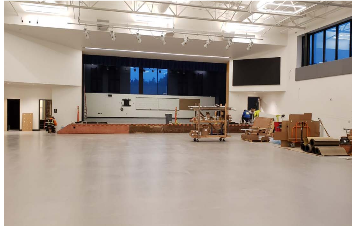
View of the Commons looking towards the Platform/Stage