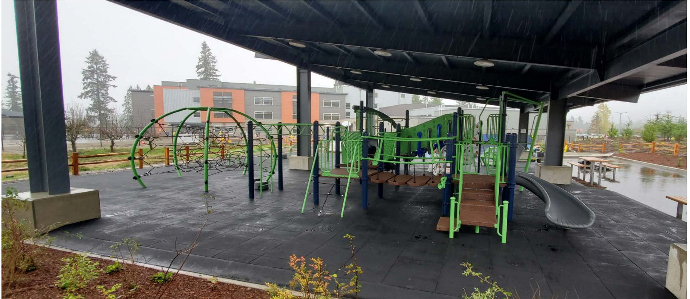
Play equipment installed and ready for use