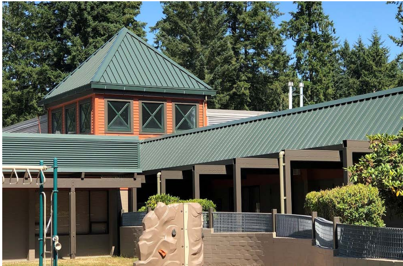
Exterior Painting Complete.