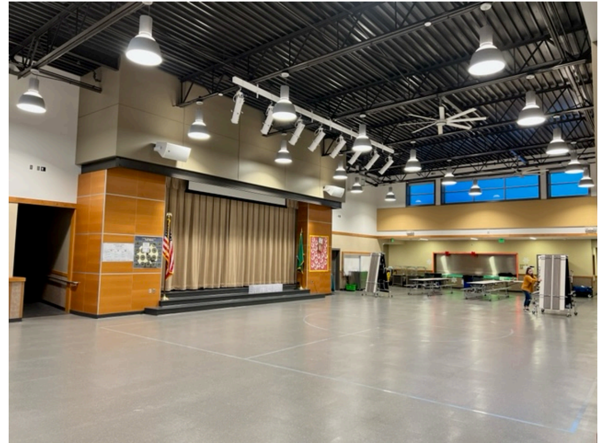
MPR and Stage area