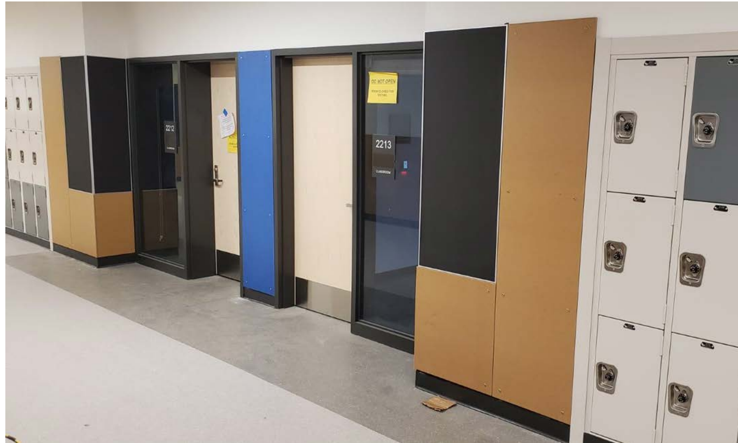
View of the classroom entry doors