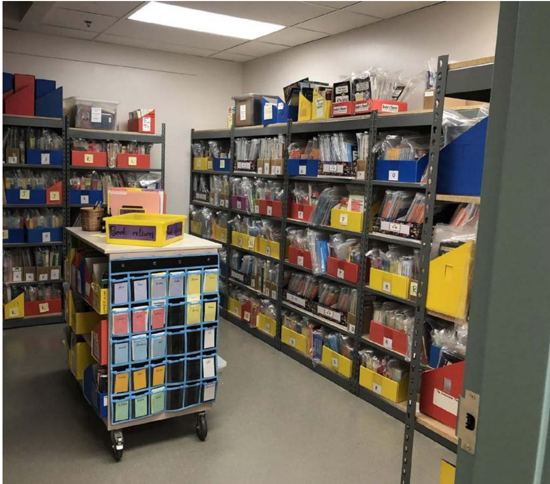
New Bookroom complete