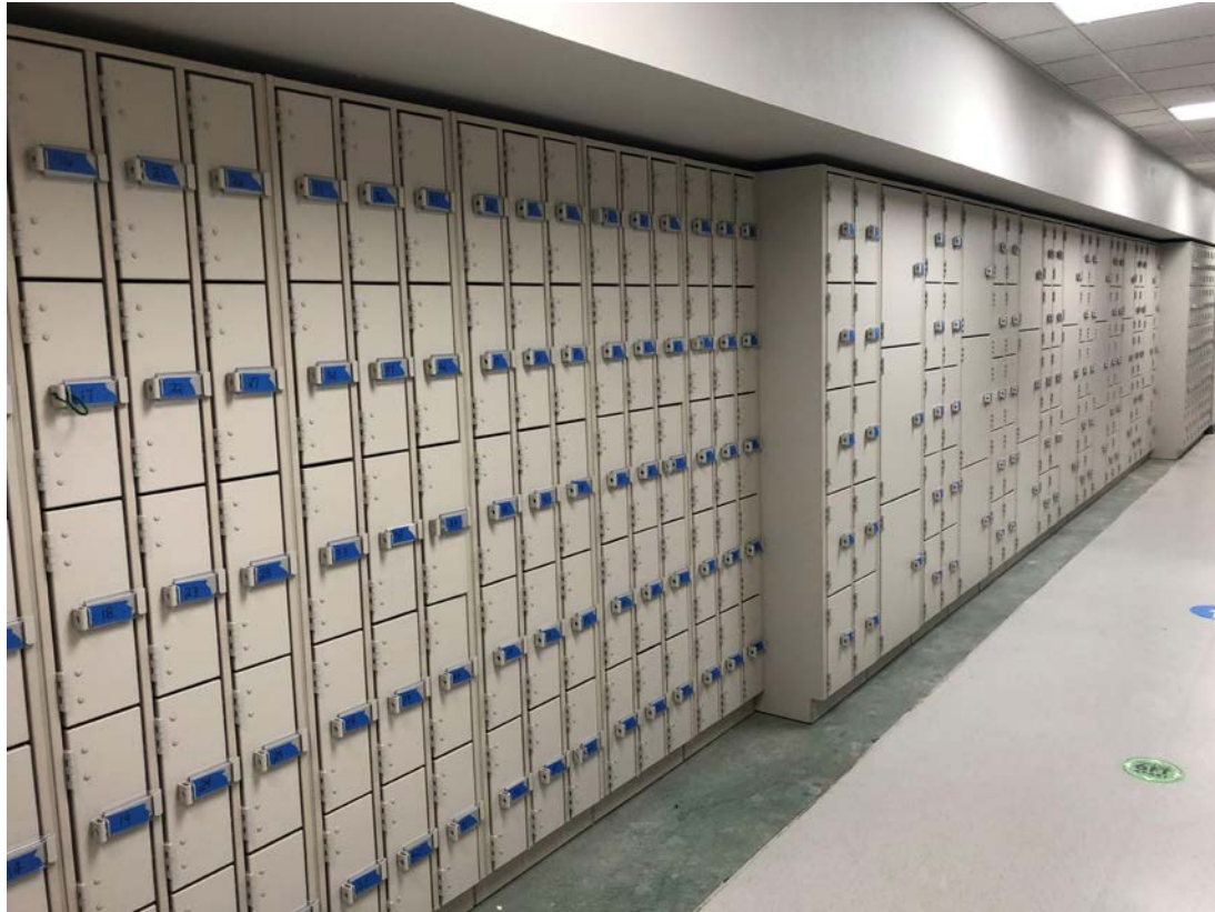
New music storage lockers installed in existing Music Hallway.