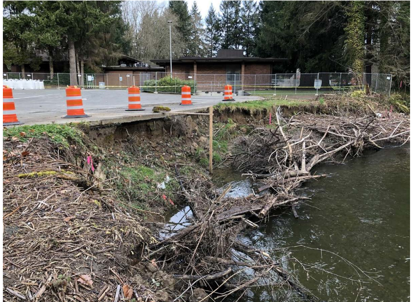
Damage done to the creek bank and parking lot