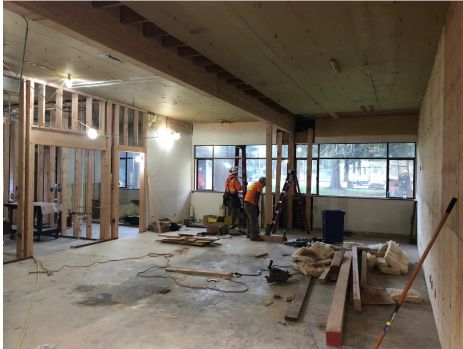
Installation of new shear walls and footings complete. Reframing of the new classrooms well underway.