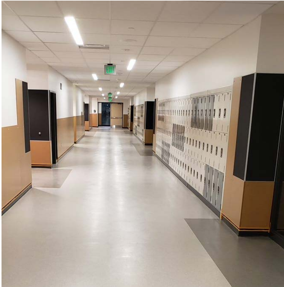
View of one of the classroom hallways