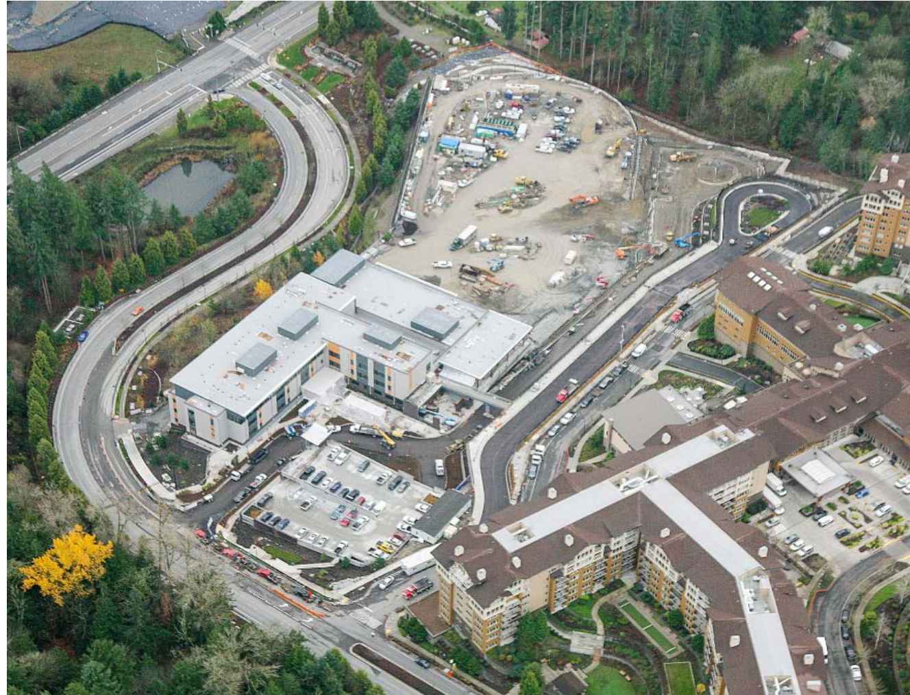
Aerial view of the site looking from north to south