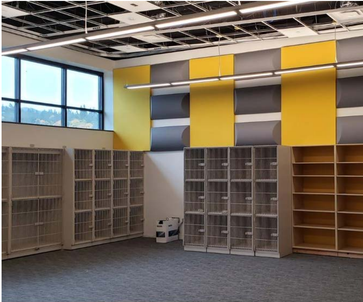
Music Rooms nearing completion