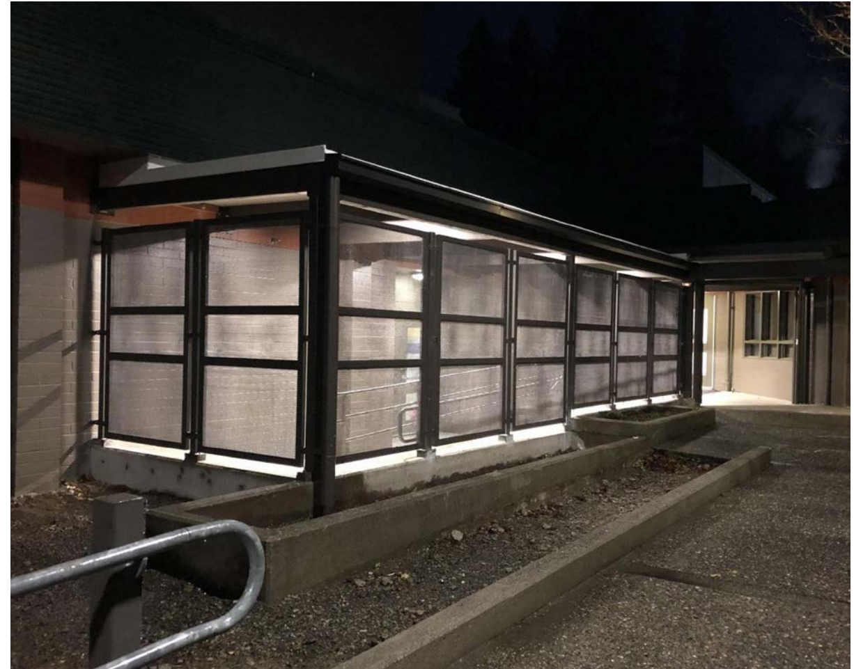
New covered and enclosed walkway from the Gym to the main building complete