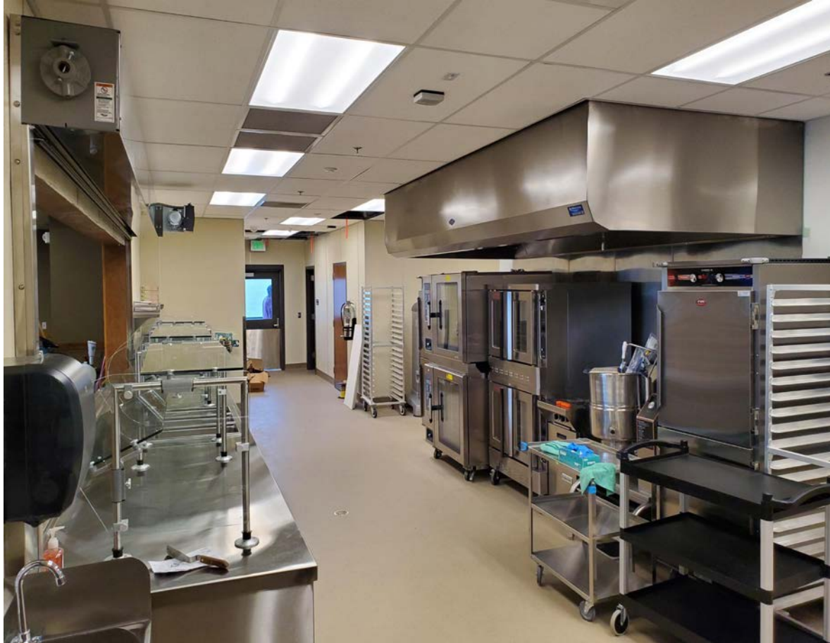
Kitchen area complete