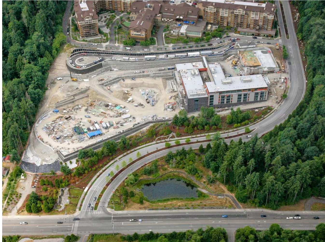
Aerial view of the site looking to the southwest