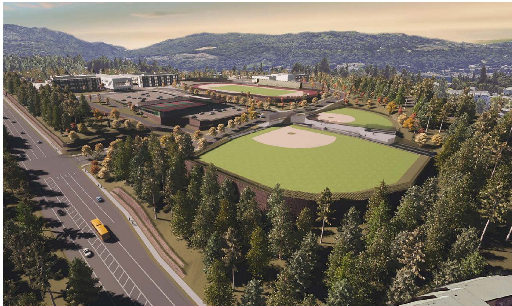
Updated rendering of the site looking to the Southwest.