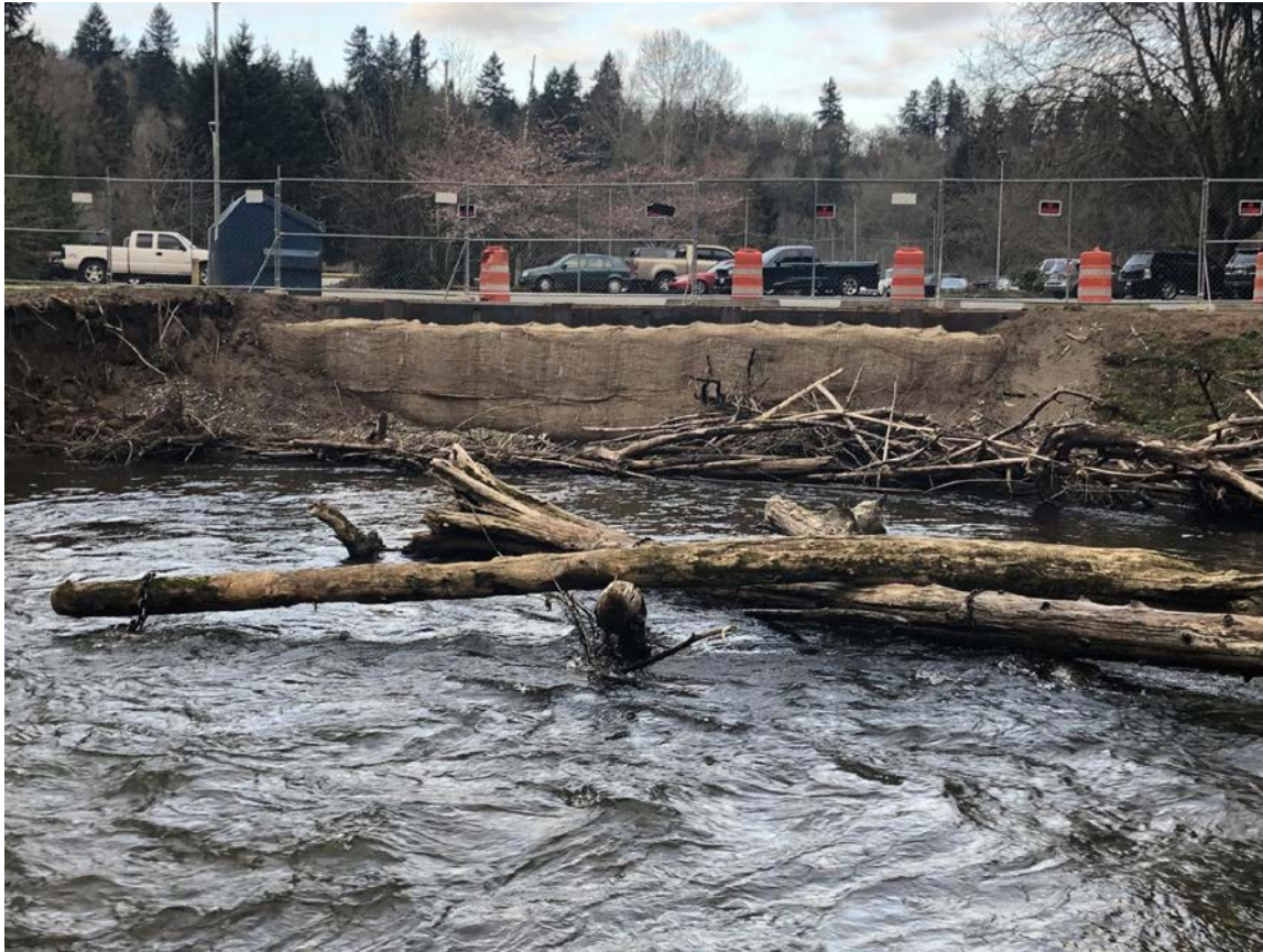
Temporary stream bank protection work completed