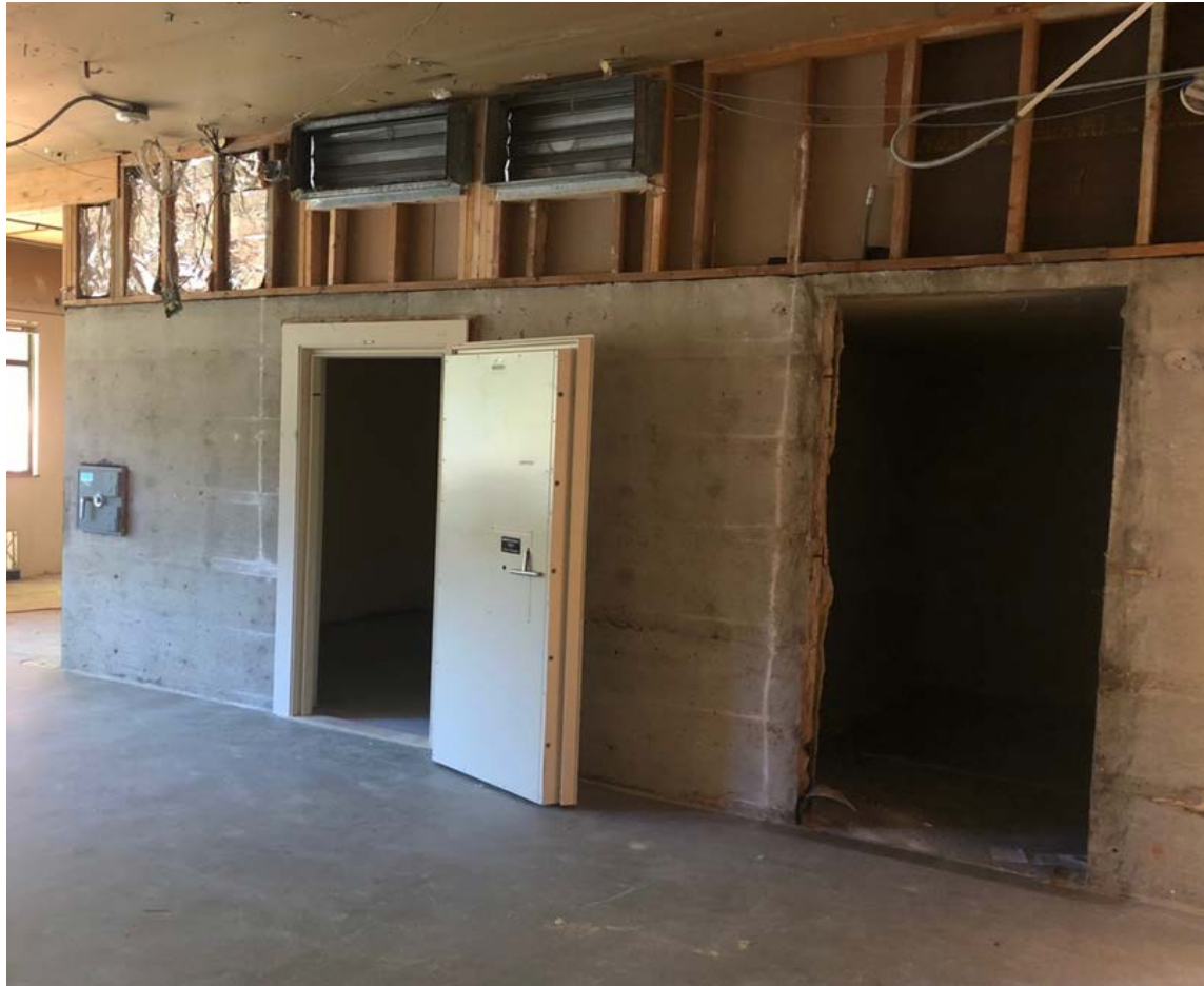
Demolition of existing vault underway.