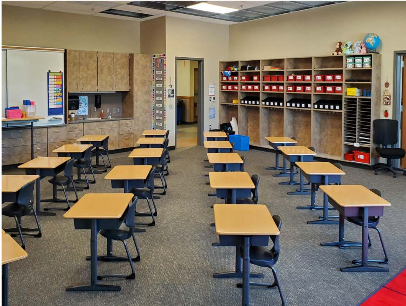
Classrooms set-up and ready for students and teachers