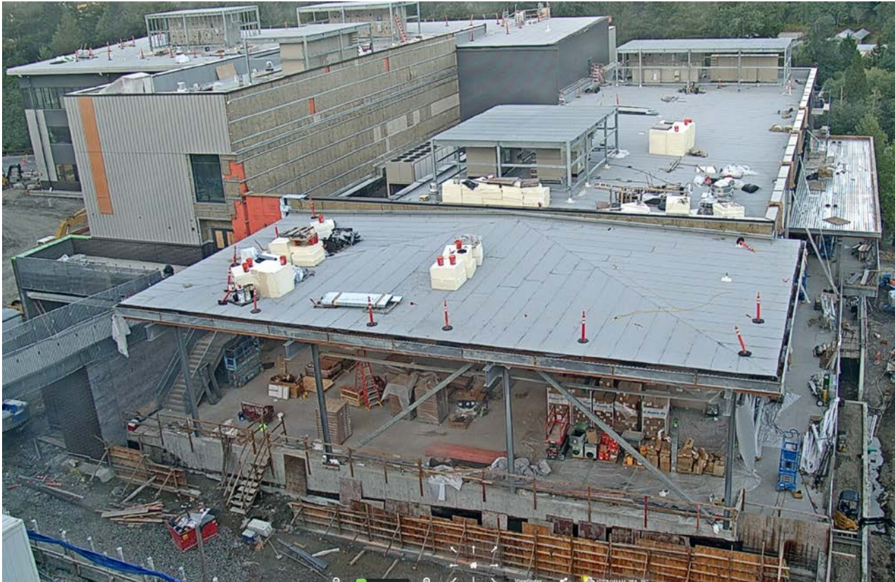
View of the covered play area, Commons and Admin/Classroom wing