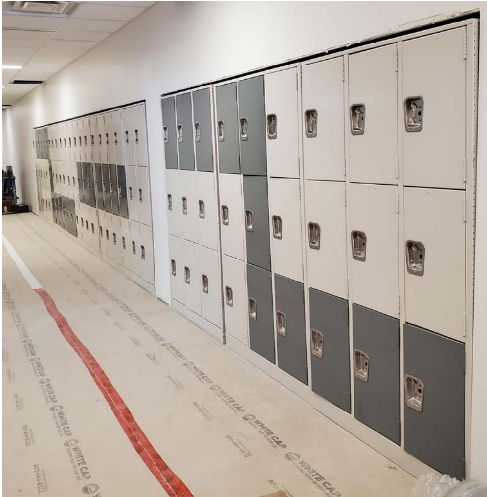
Student lockers install in some of the corridors