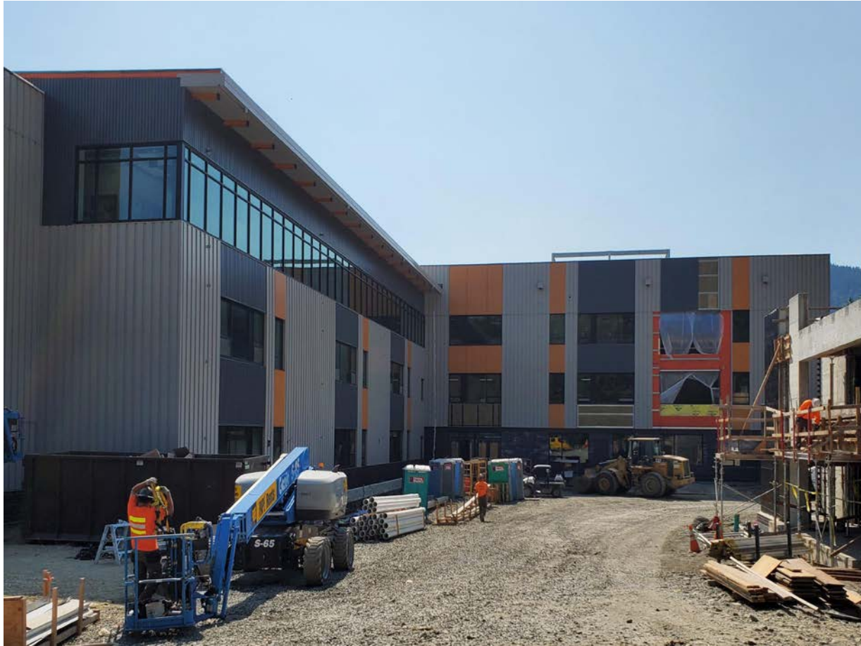
View of the main entrance to the building from the main entrance drive