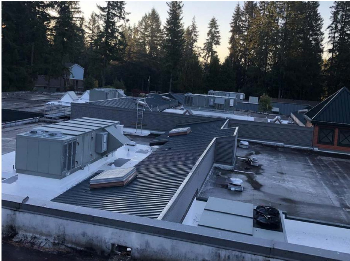
New HVAC units installed