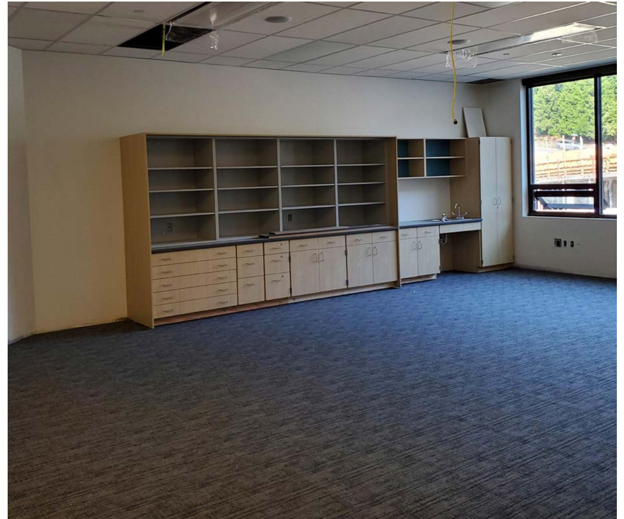
Flooring, cabinetry and other finishes going into the classrooms