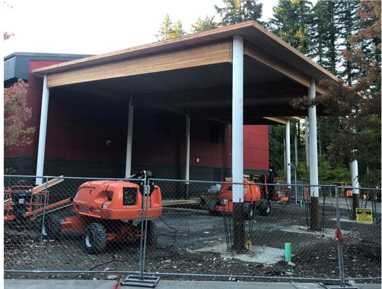
Covered Play Area roof nearing completion.