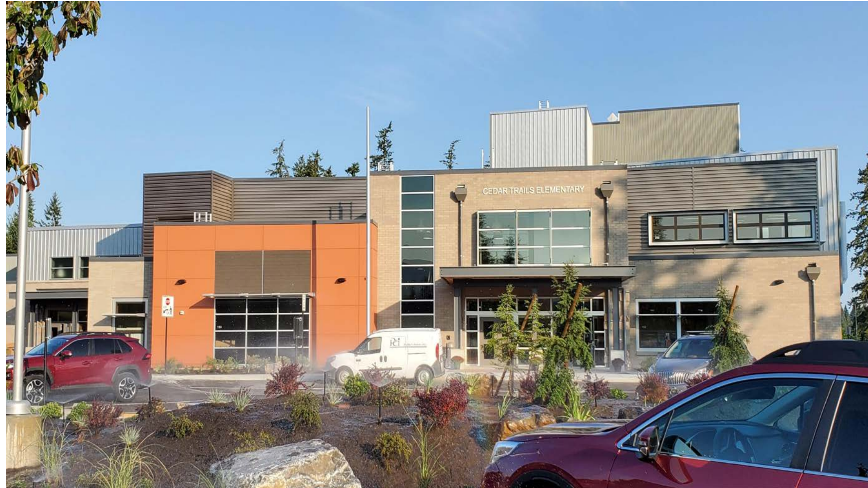
View of main entrance to the building