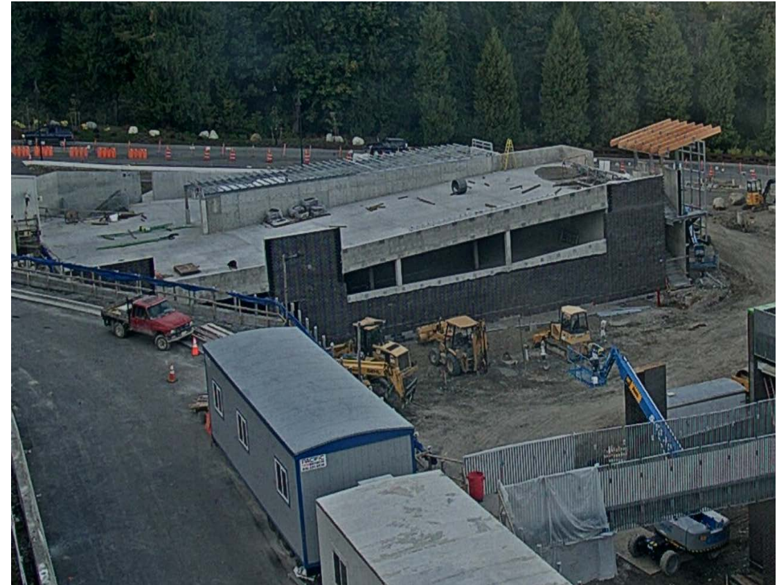
Exterior brick of the parking garage being installed