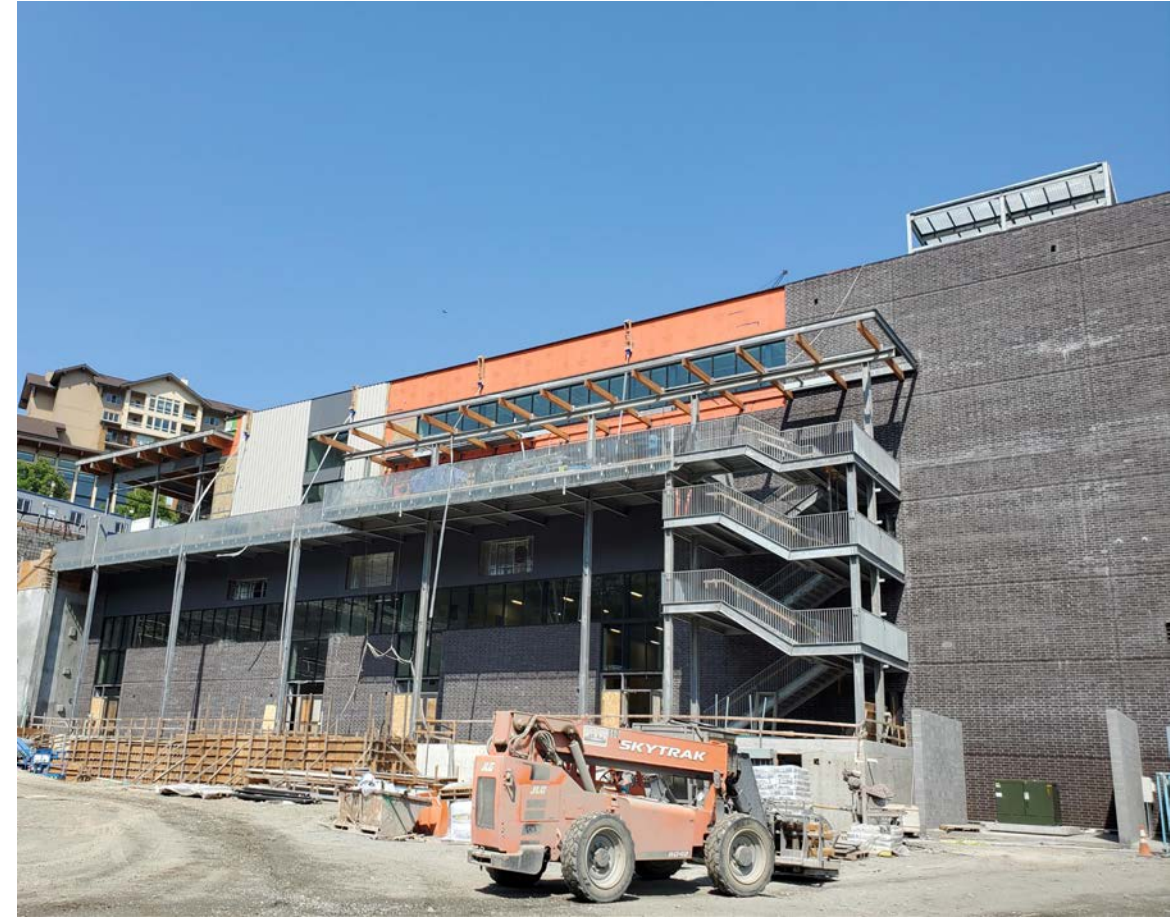
View from the sports field plaza looking north east at the building