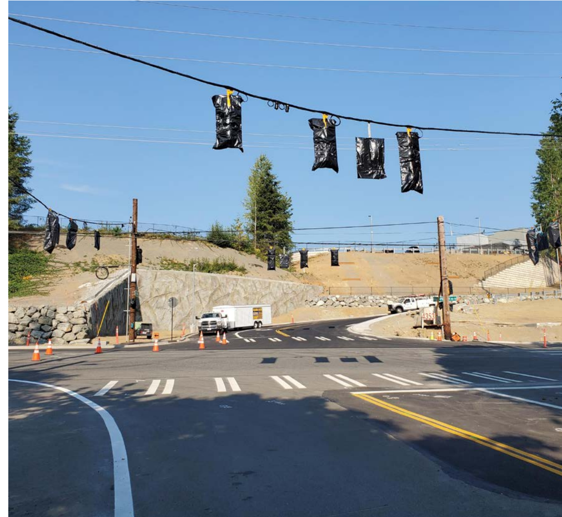
New intersection and traffic signal at Issaquah-Pine Lake Road & SE 44th