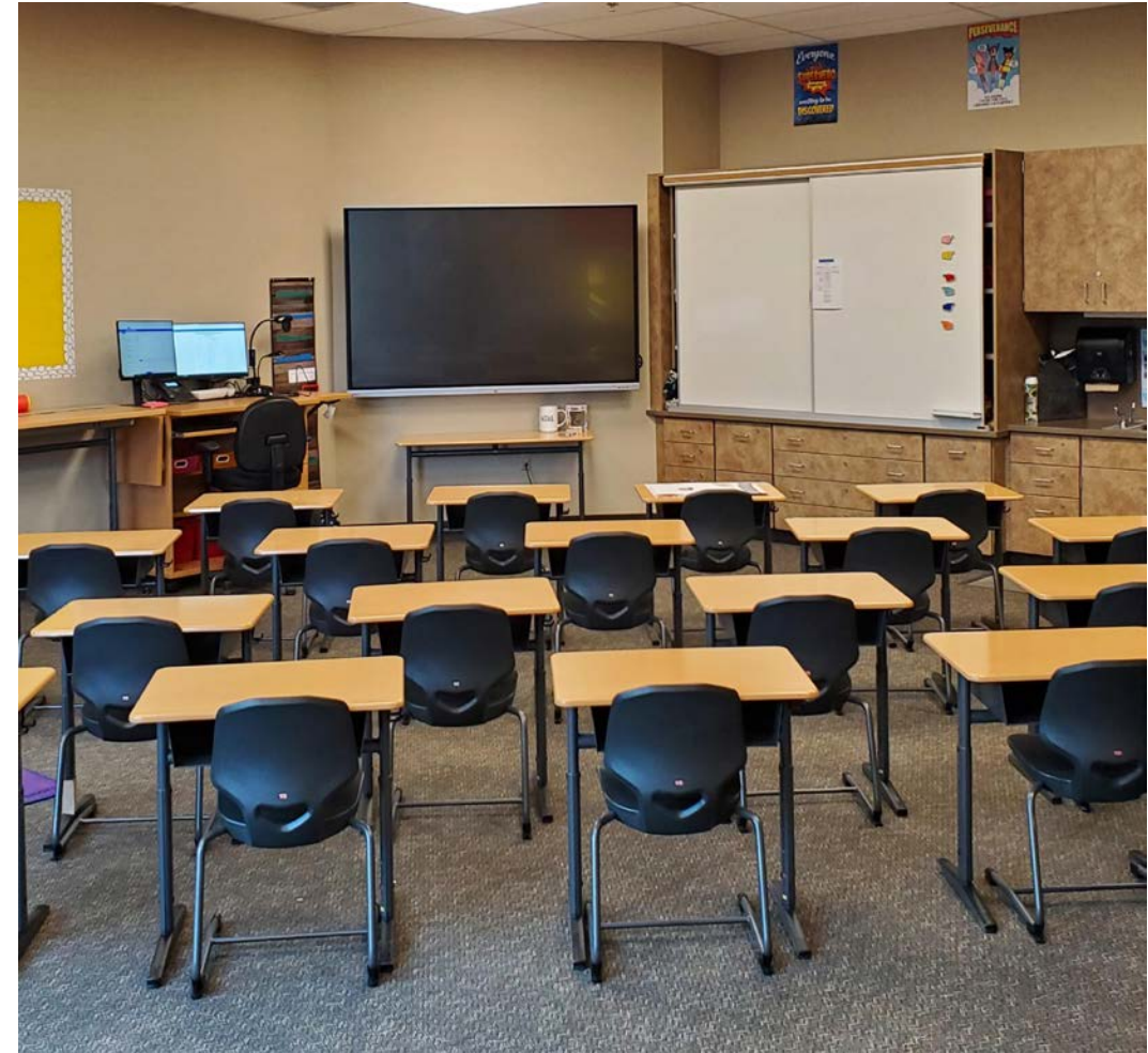
Classrooms set-up and ready for students and teachers