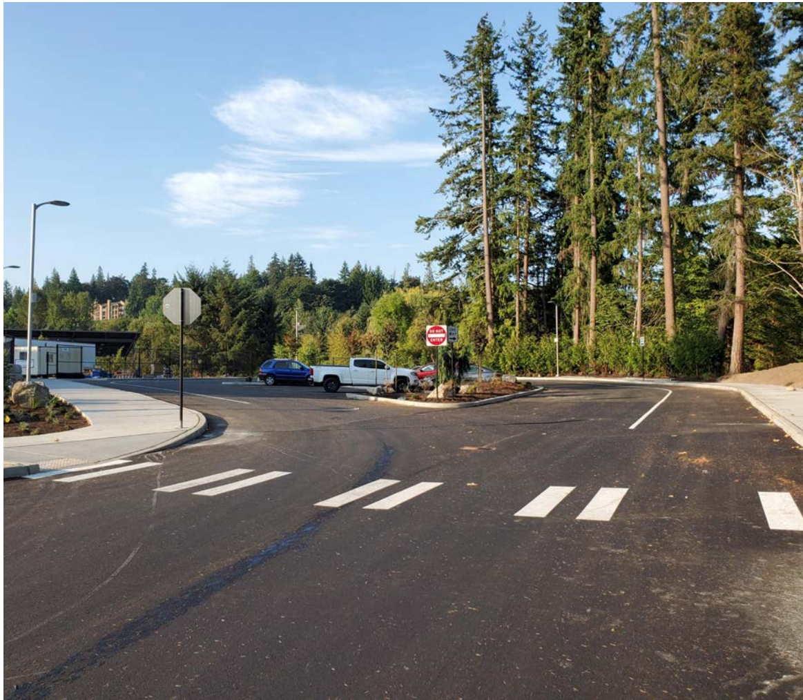
Bus Loop ready for buses