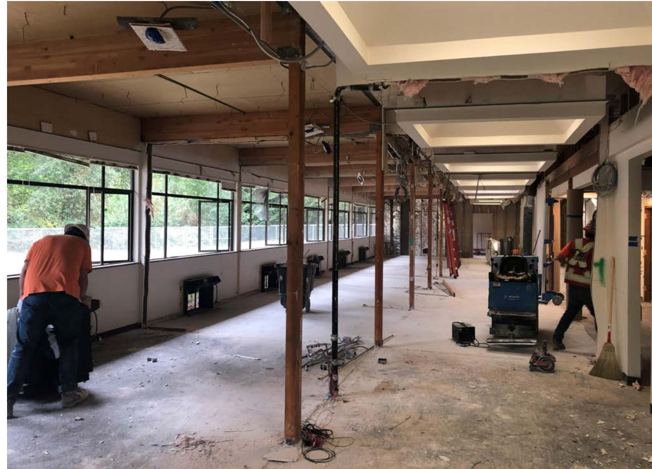
Demolition of existing offices, lunch room, etc. underway.