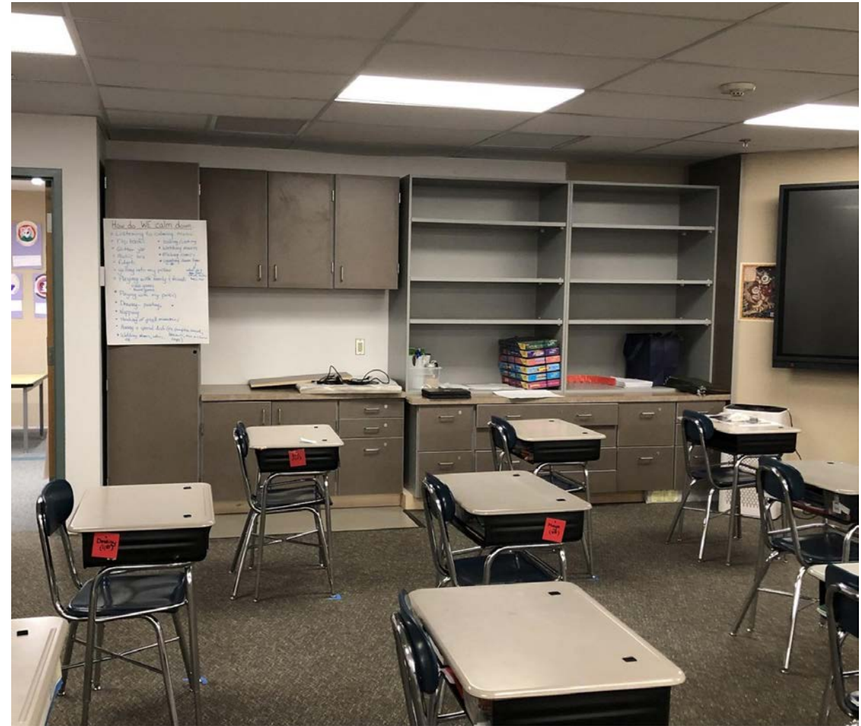
New classrooms completed and occupied