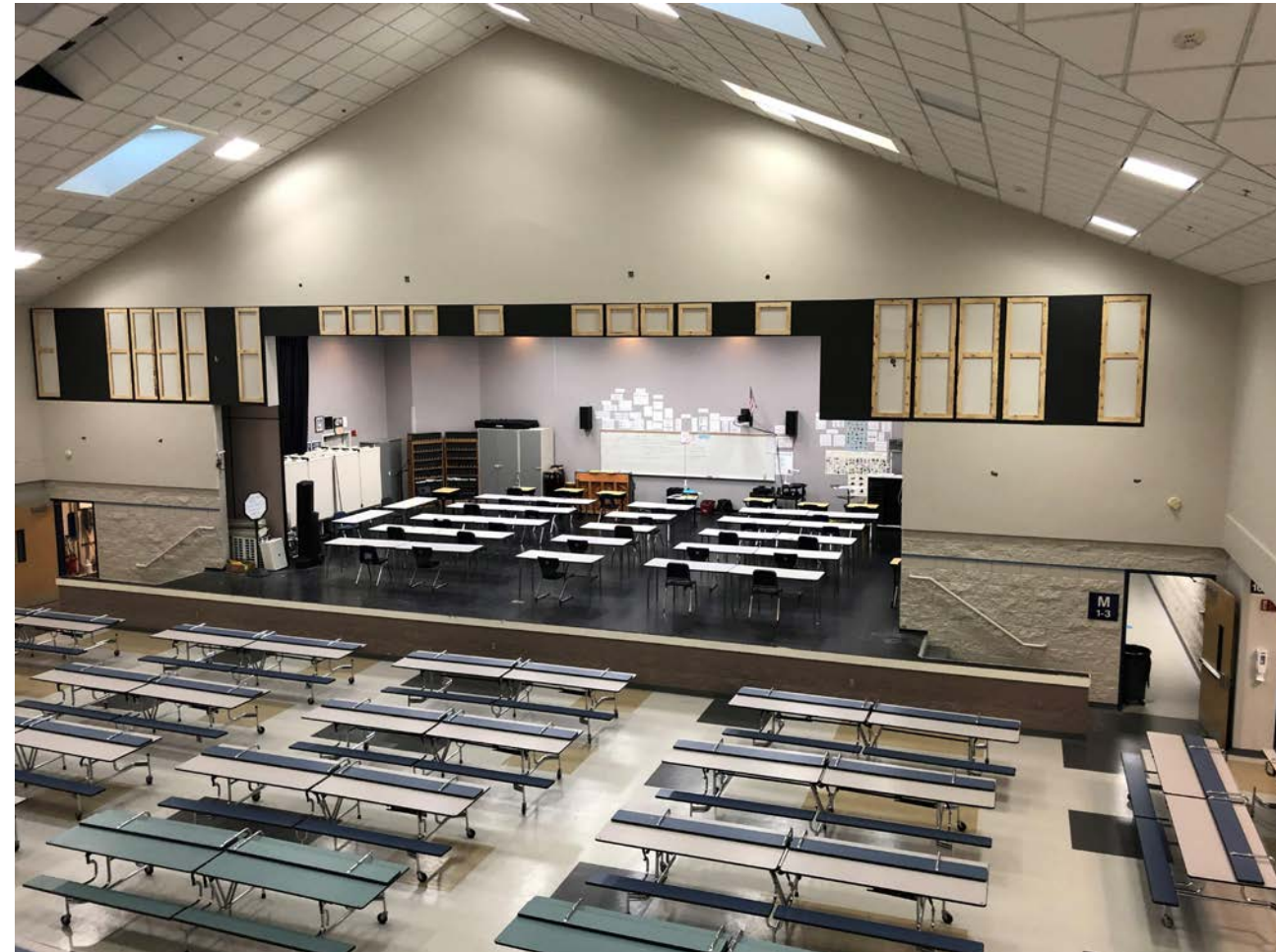
New finishes and acoustical panels being installed in existing Commons.