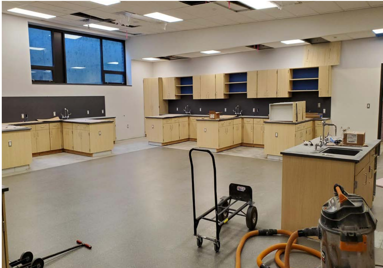
Flooring, cabinetry and other finishes and equipment installed in the Science Classrooms