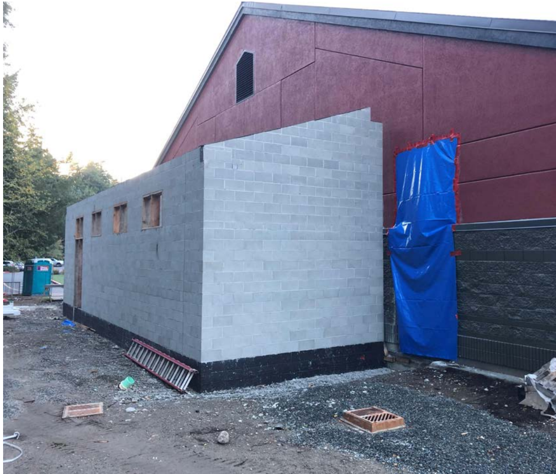
Music Storage Room CMU exterior block nearing completion.