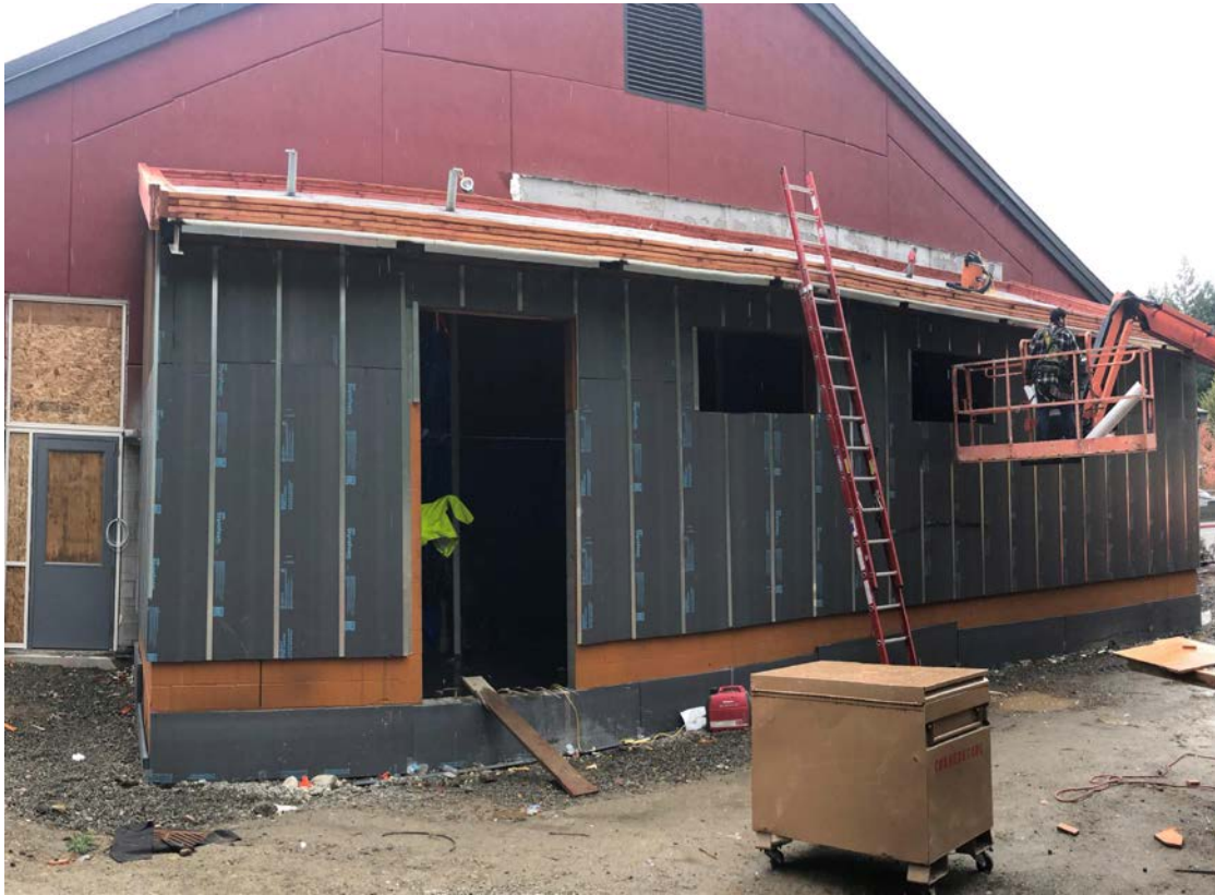
Music Storage Room roof and exterior finishes well underway.