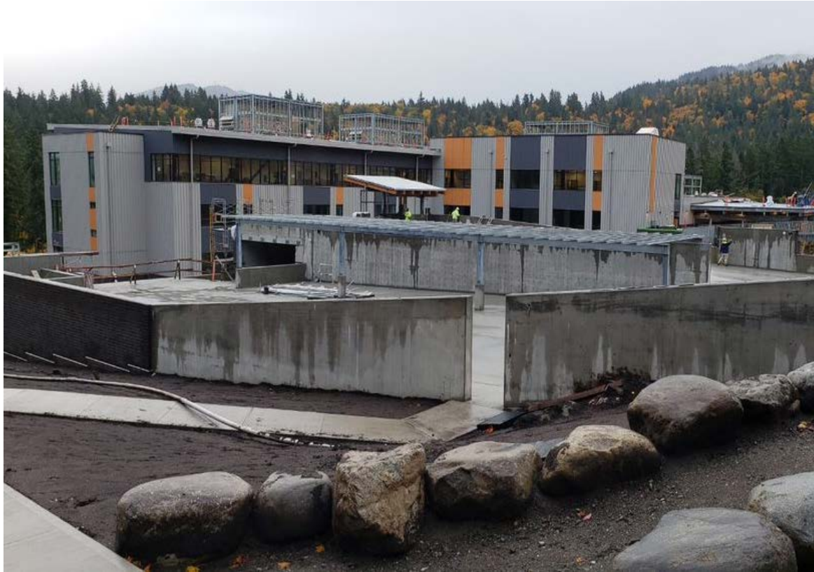
View of the parking garage and the main building looking southeast from the corner of Talus Drive & Falcon Way