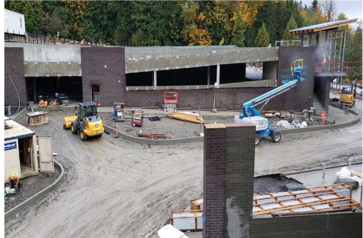
View of the parking garage from the covered play area