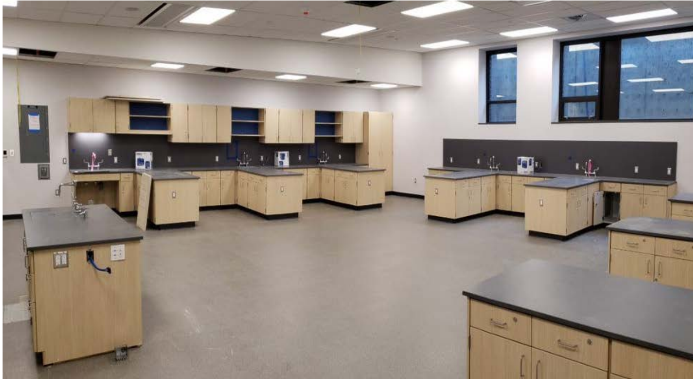
Science Classrooms nearing completion