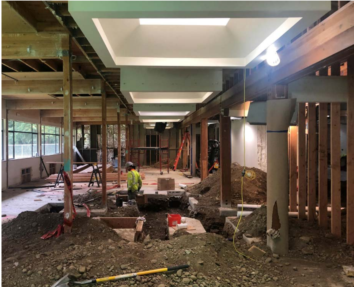
Installation of underground plumbing underway.