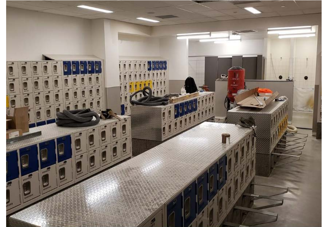
Locker Rooms nearing completion