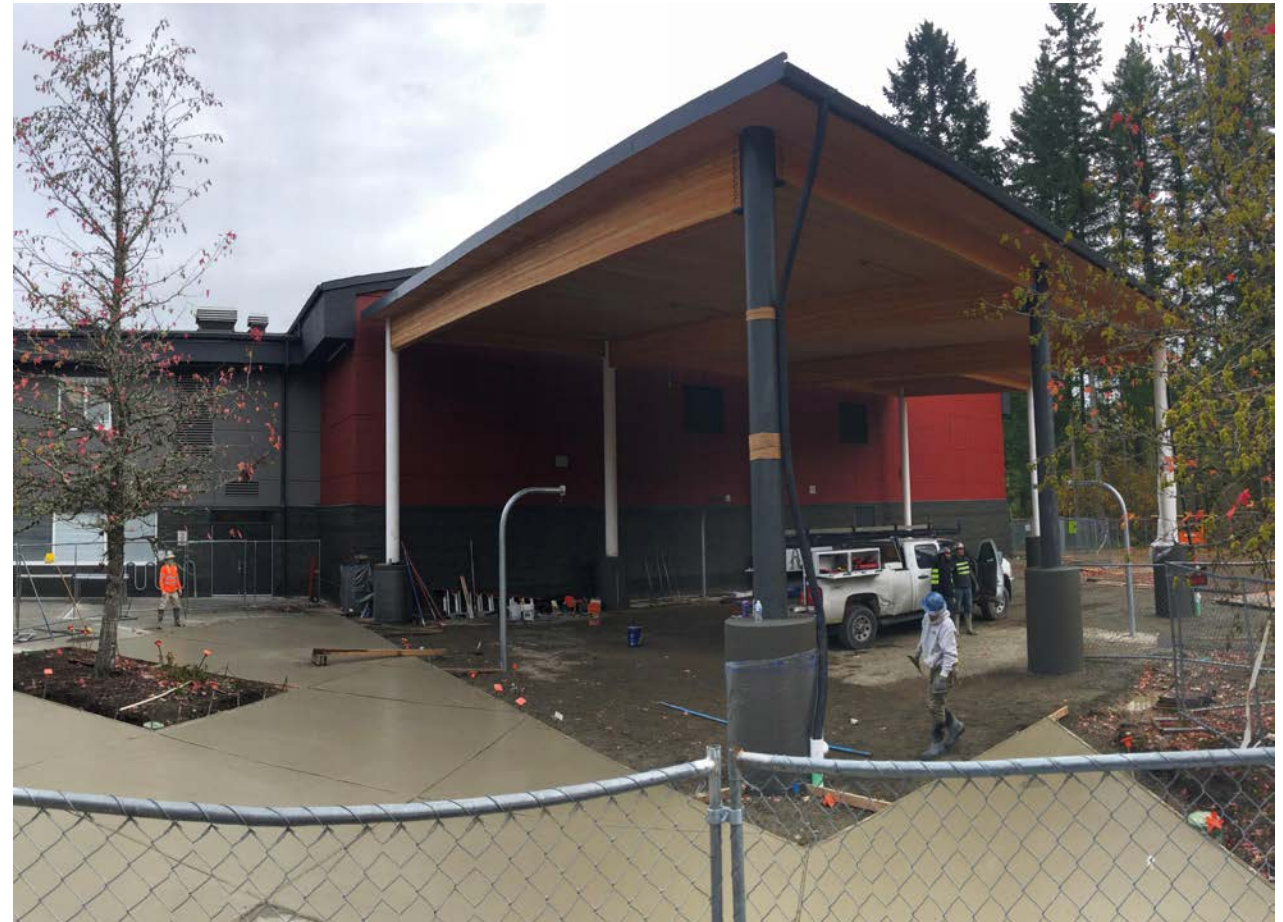
Covered Play Area nearing completion