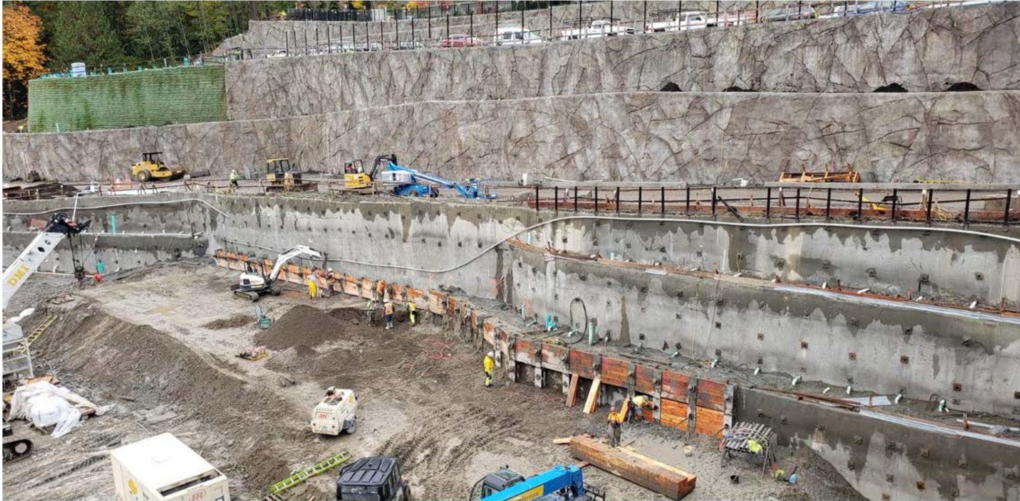
View of the various retaining walls as they step up the site from the sports field level