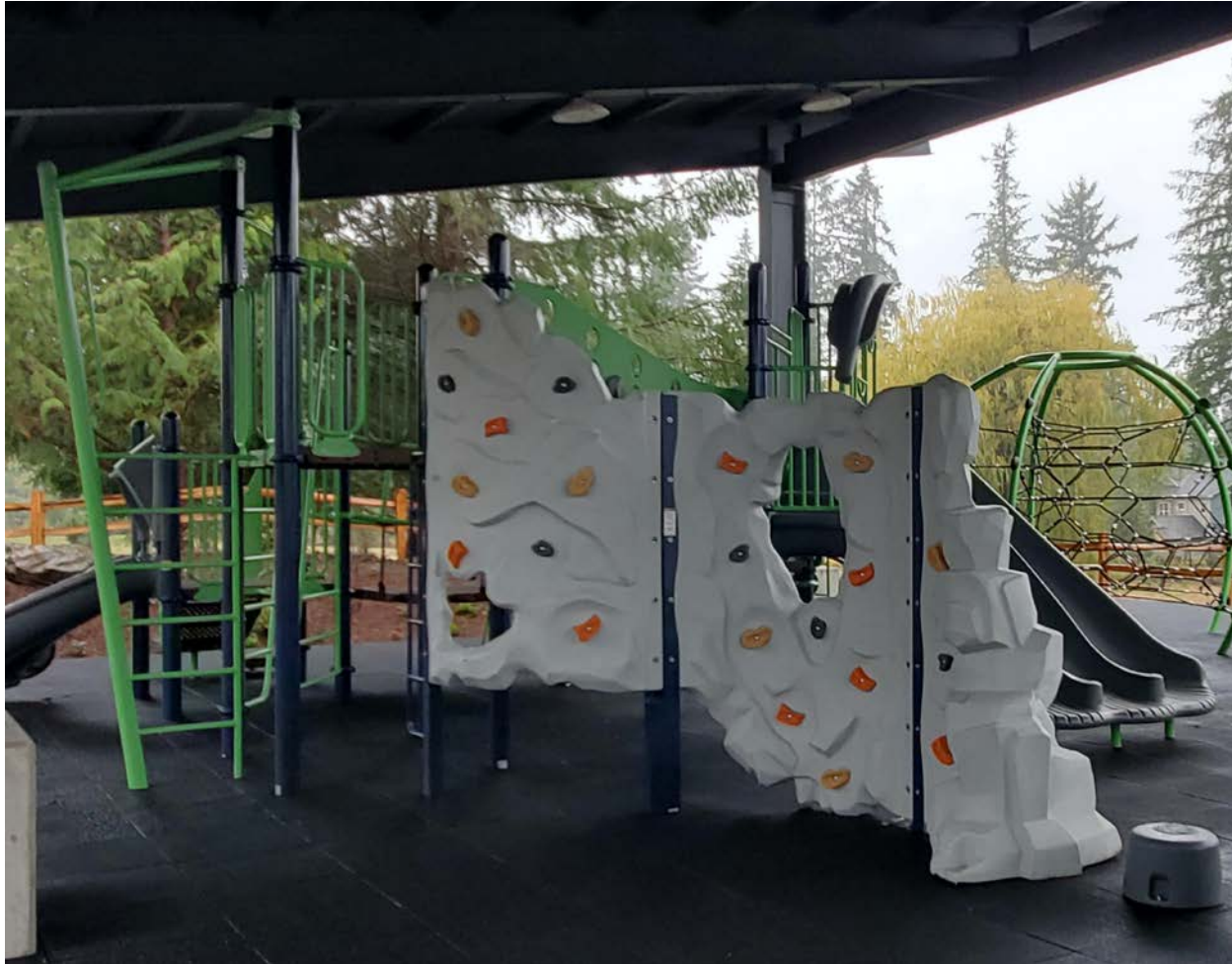
Play equipment installed and ready for use on Monday