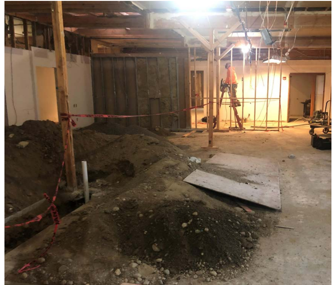
Installation of new shear walls and footings underway.