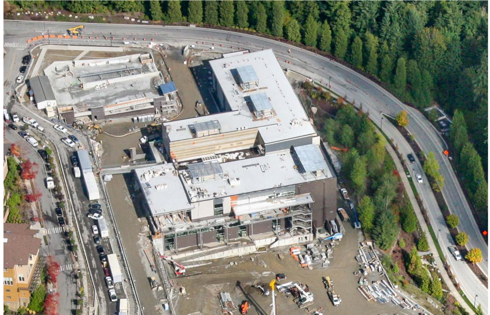
Aerial view of the site looking from south to the north