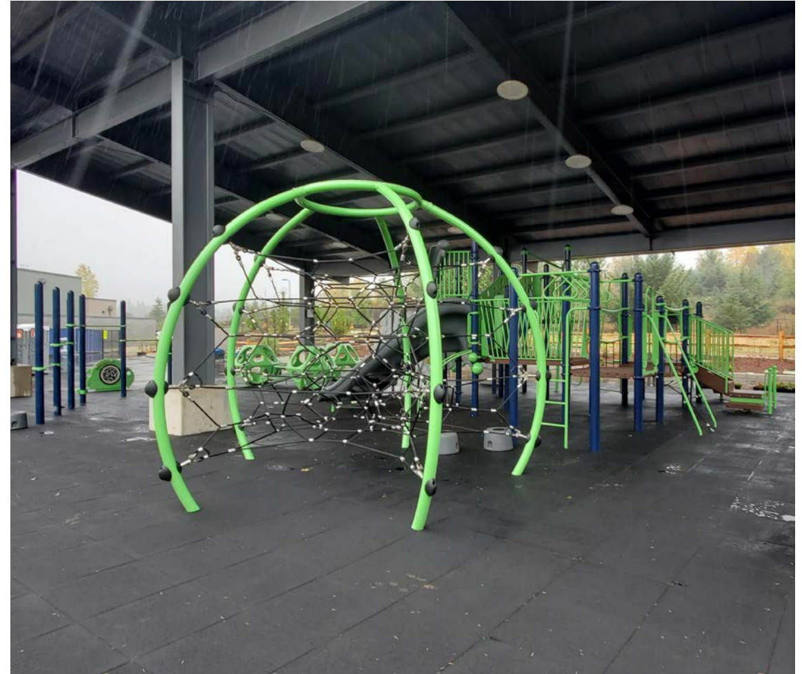
Play equipment installed and ready for use on Monday