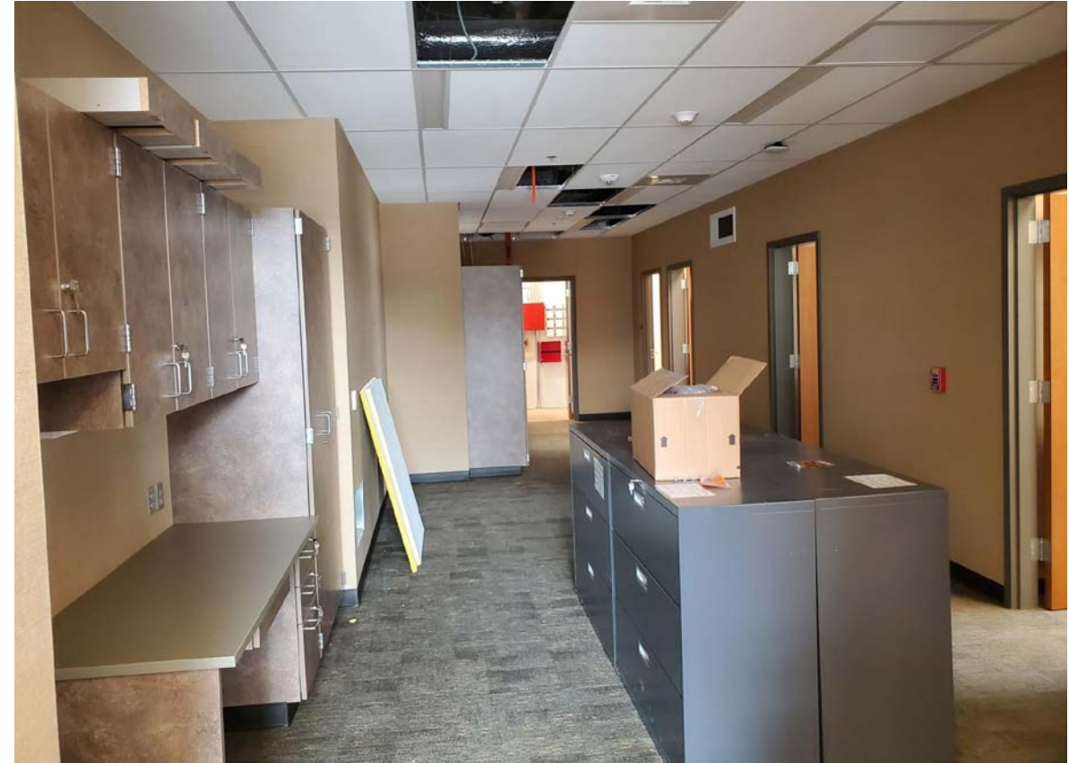
Work Room area