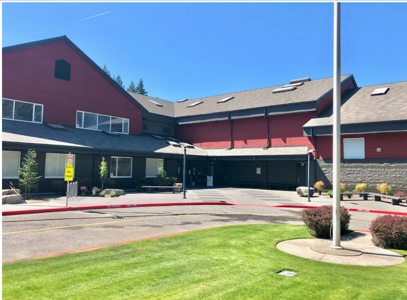
Painting of the exterior of the building complete.