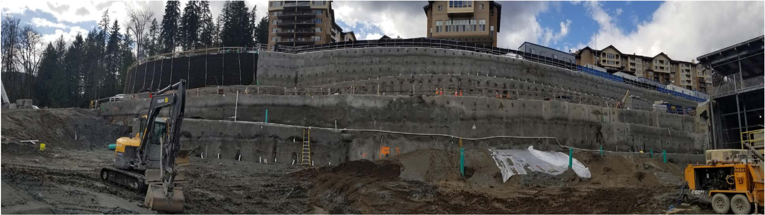
View of various stepping site walls from near sports field level looking west