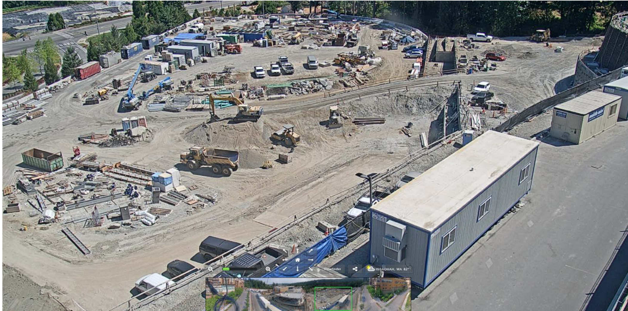
View from parent loop of the sports field