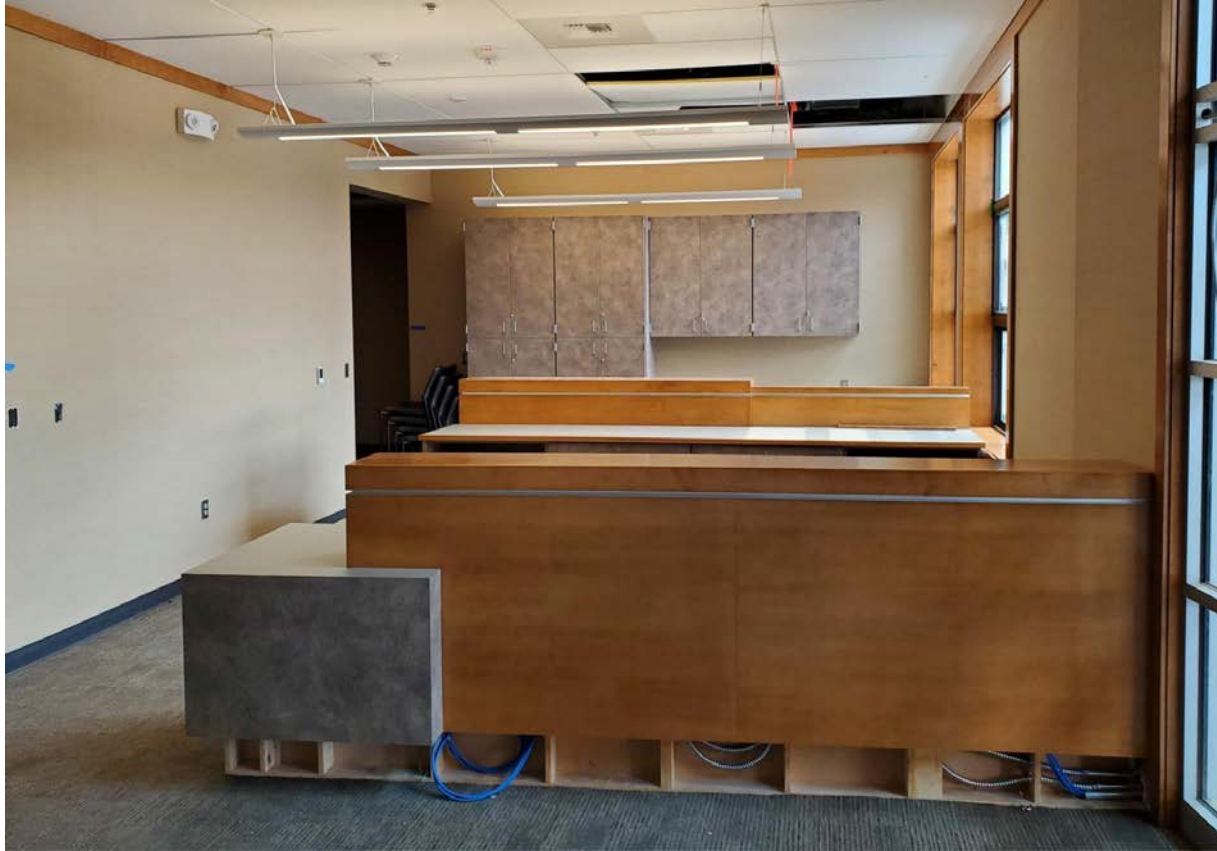
Main Office area