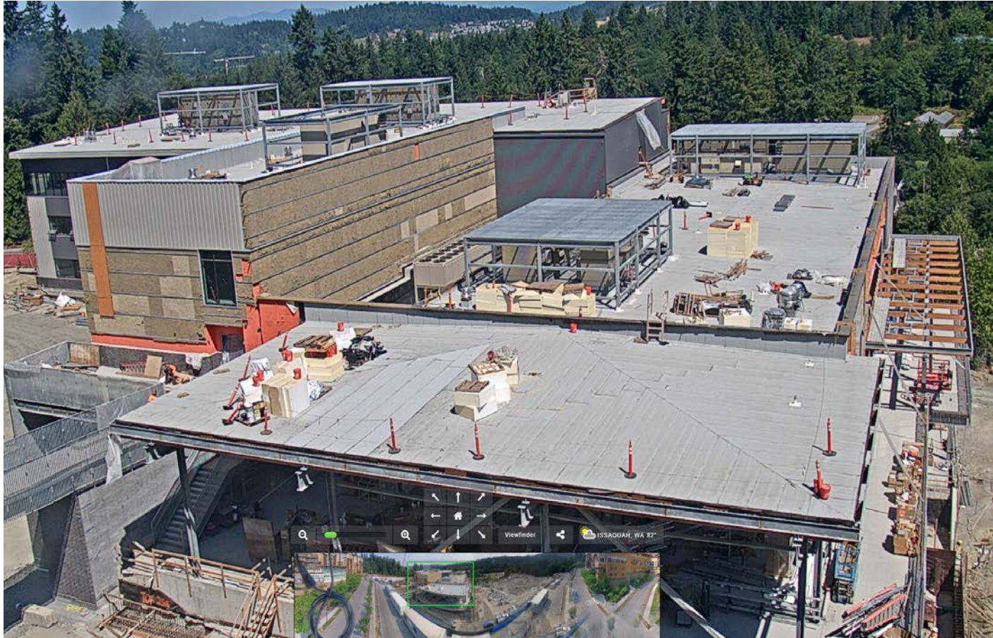
View of the covered play area, Commons and Admin/Classroom wing