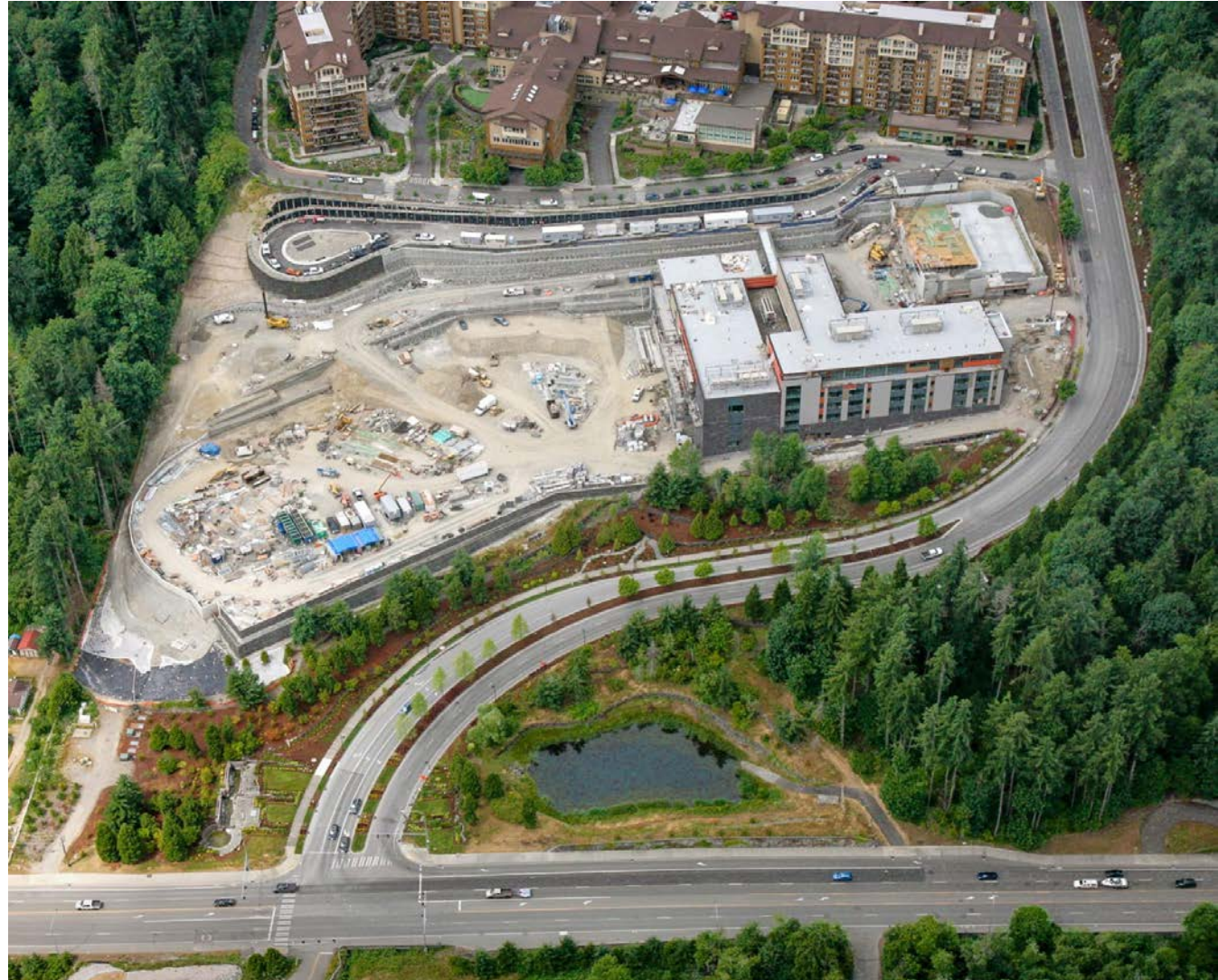
Aerial view of the site looking to the southwest