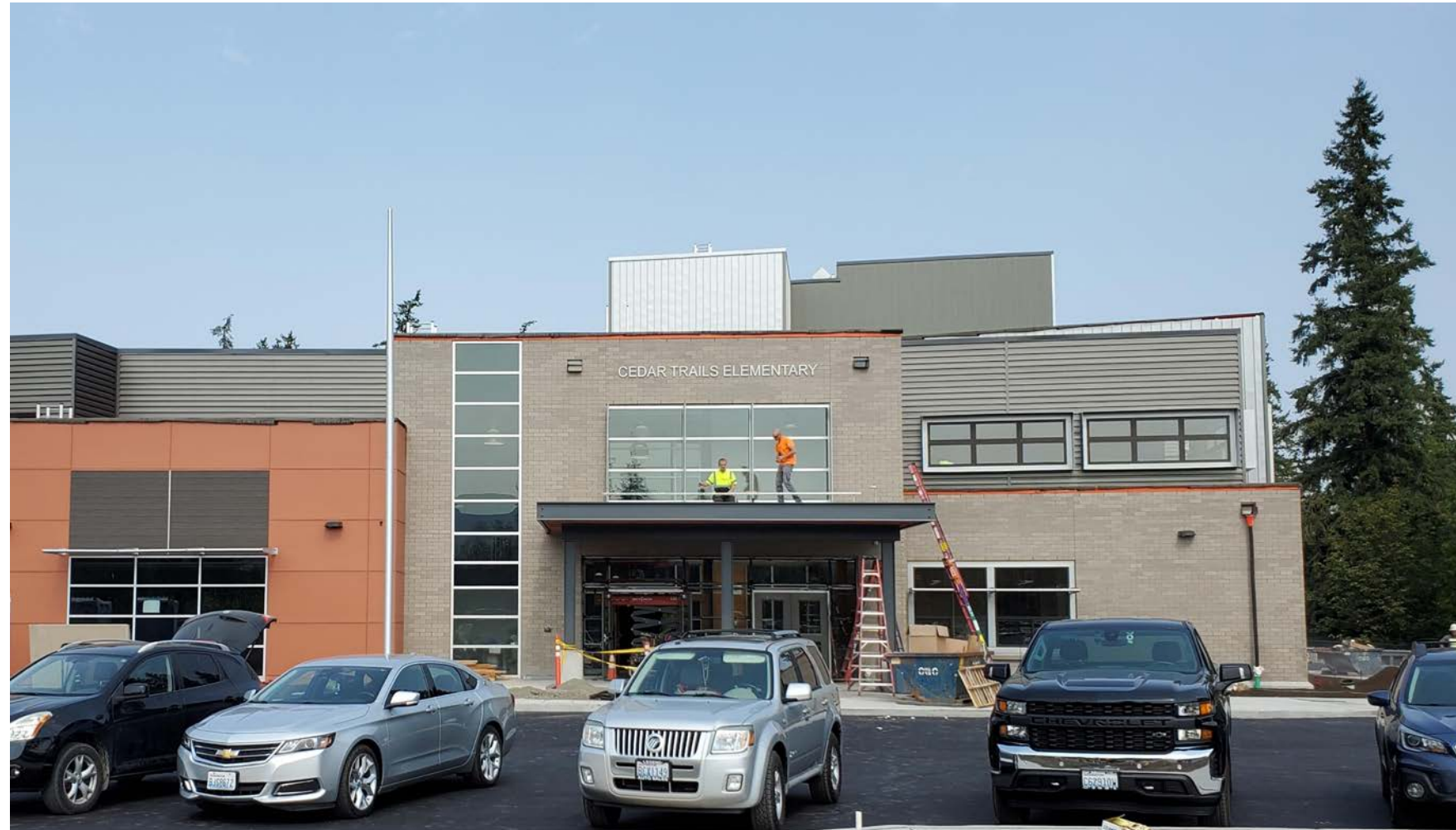
View of main entrance to the building with exterior skin of the building complete in some areas