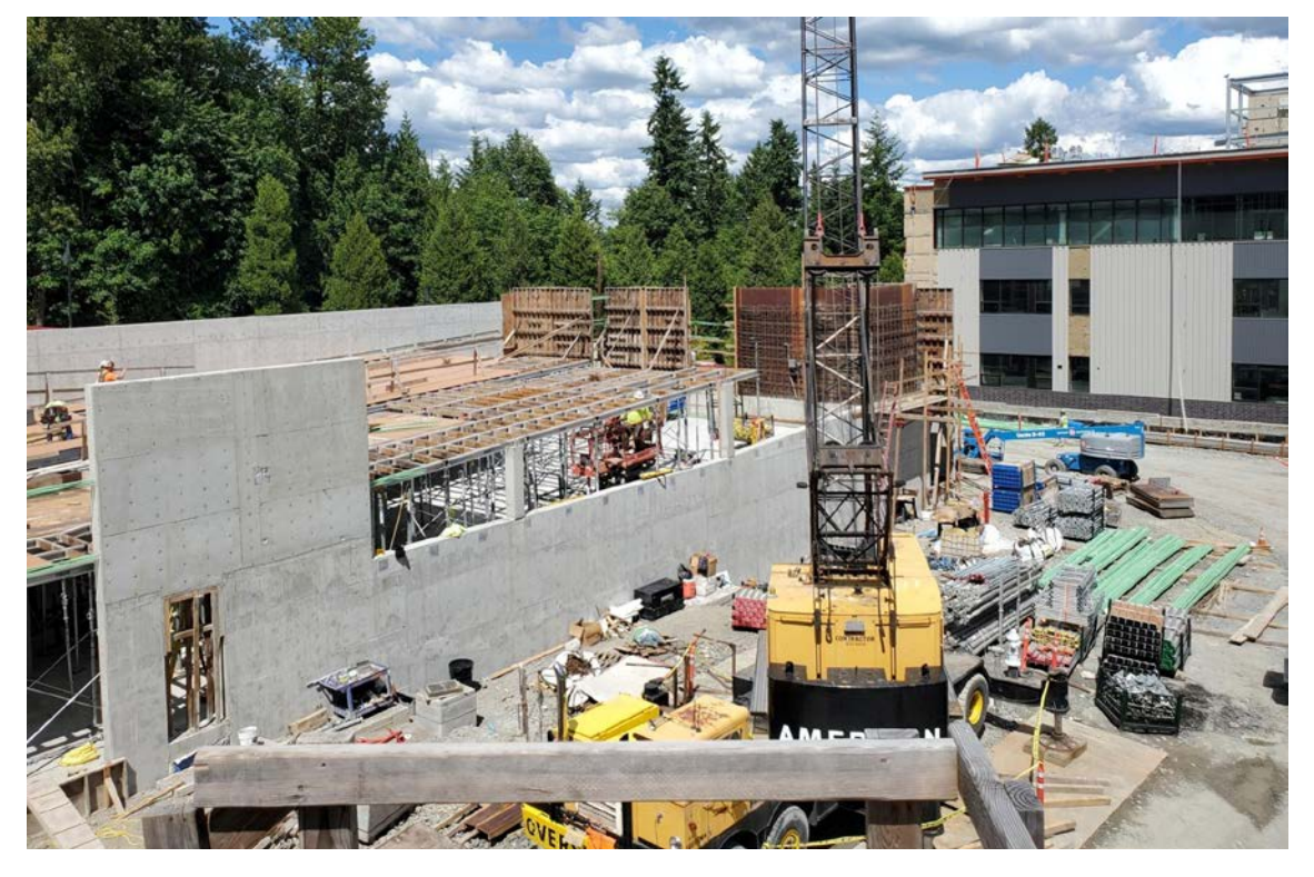
Top level of the parking garage be prepped & formed for concrete pour