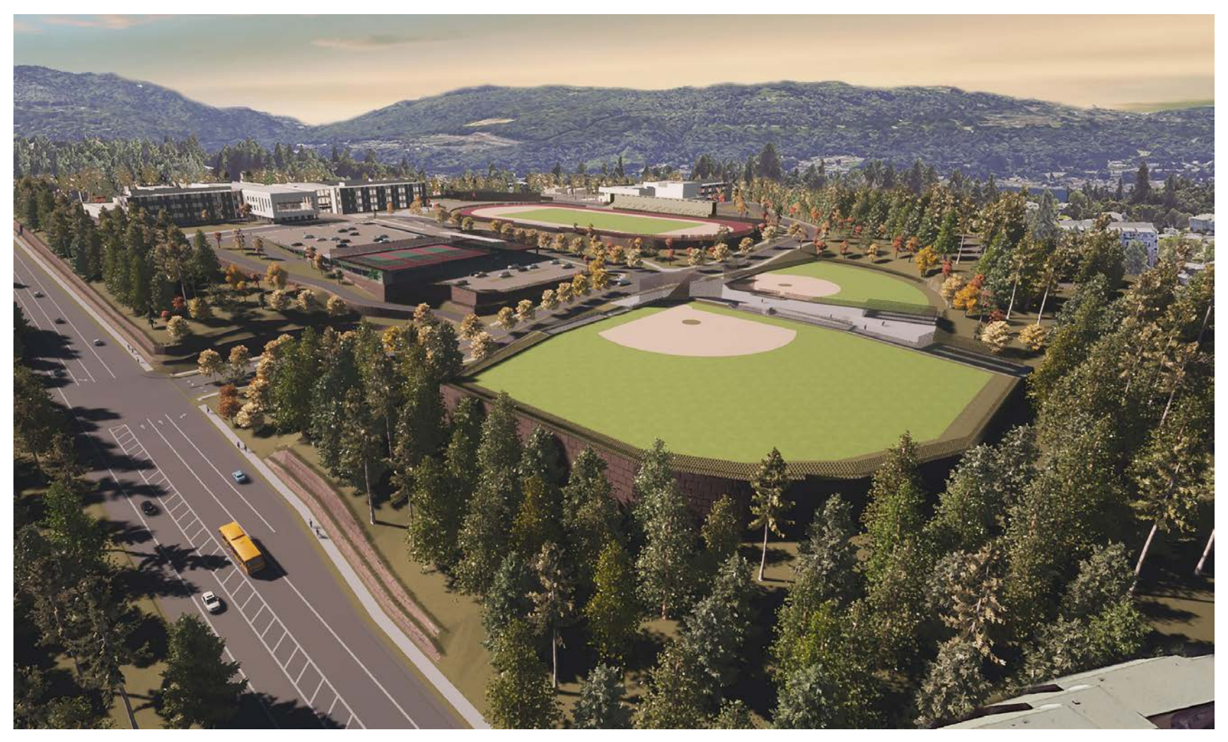
Updated rendering of the site looking to the Southwest.