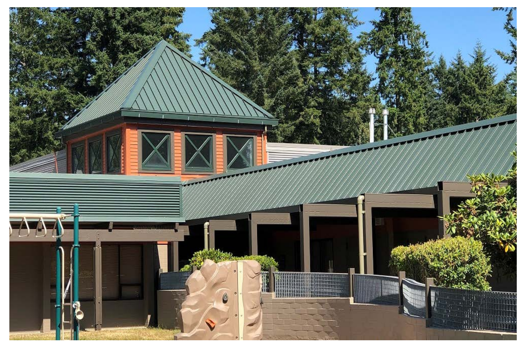
Exterior Painting Complete.