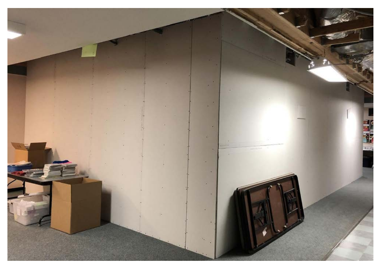
Framing and sheetrock for new offices in pod area underway