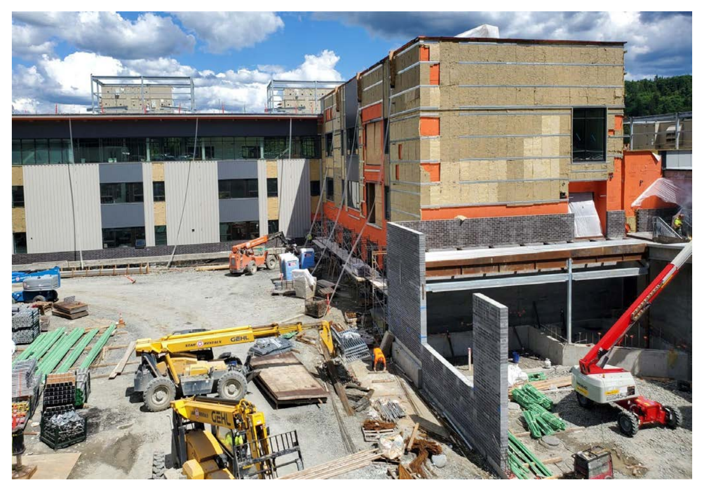
View of main building entrance and loading dock

View from parent loop of exterior balcony, Commons and Gyms