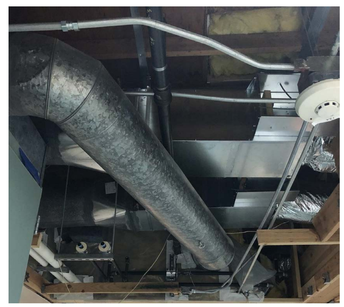
New HVAC and electrical underway