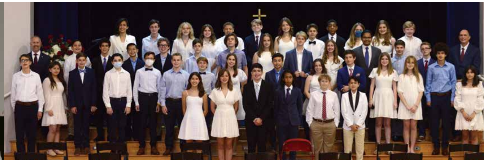
The Class of 2021