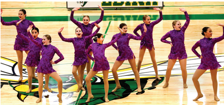
This year EDT has created a dance club for sixth graders.