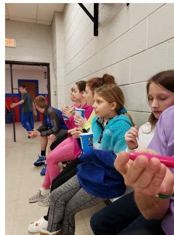
KONA Ice Day