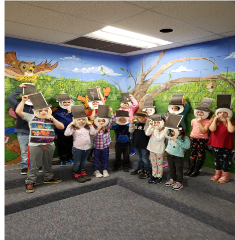
Presidents' Day Masks were made in art class