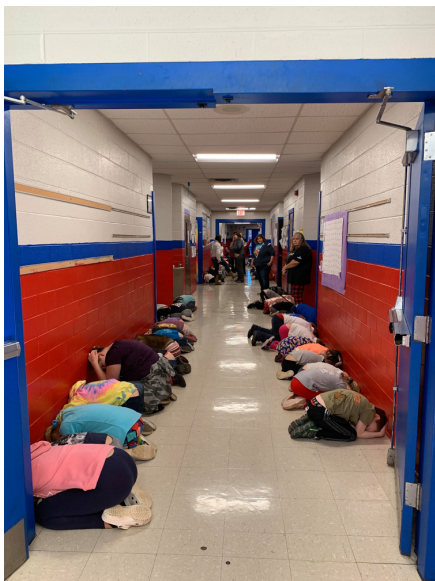
MRC tornado drill.