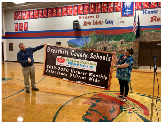
2nd Month Attendance Award