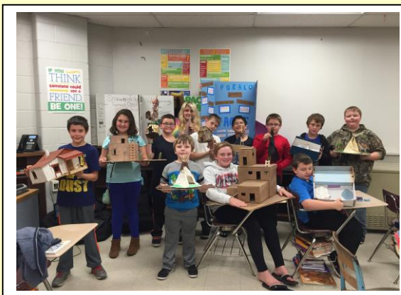
5 th Grade students shown with their models of historical Native American shelters.