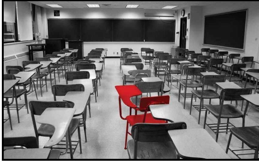
FR School Committee Approved 11.08.2021

Fall River Public Schools' goal is to ensure that every student attends school regularly and is actively engaged in their learning. Attending school regularly has a huge impact on a student's academic success and helps them feel better about school—and themselves. Families play a key role in building this habit from Pre-Kindergarten through 12th grade, so that students learn right away that going to school on time, every day is important. Developing the skill of consistent attendance is something that will help students succeed in college and in the workplace.