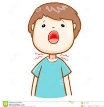
Strep Throat/Scarlet Fever