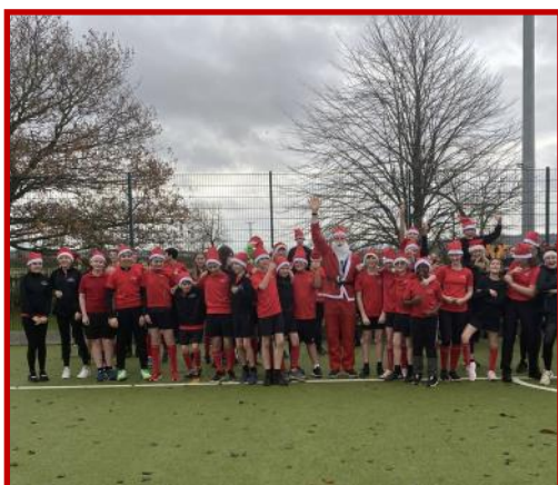
This week, all students have taken part in a Santa Fun Run during PE lessons. All donations will be going to Katharine House Hospice, thank you to everyone for taking part.