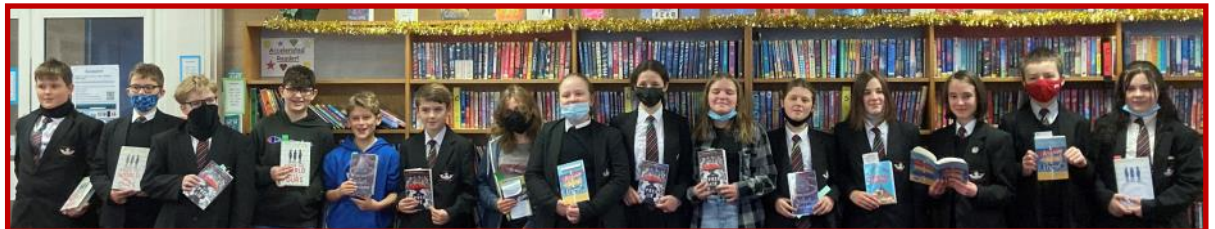
A few of the students who have taken on the Warwickshire Book Award challenge

They are all fantastic new books published in the last year, but which one will win the Award? We will have to wait until the votes are counted in March.