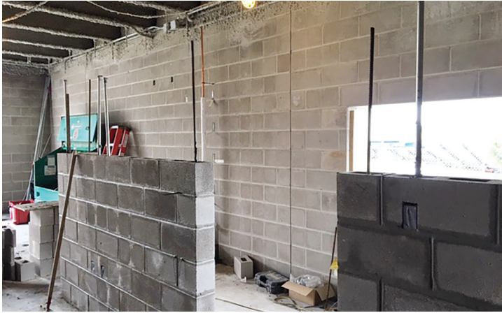
Interior CMU walls being constructed at the High School Team Room Addition.