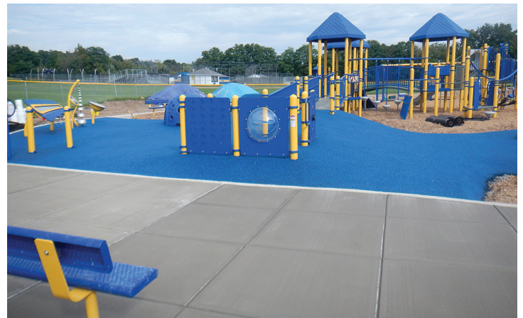
ADA compliant Primary School Playground sidewalks complete.