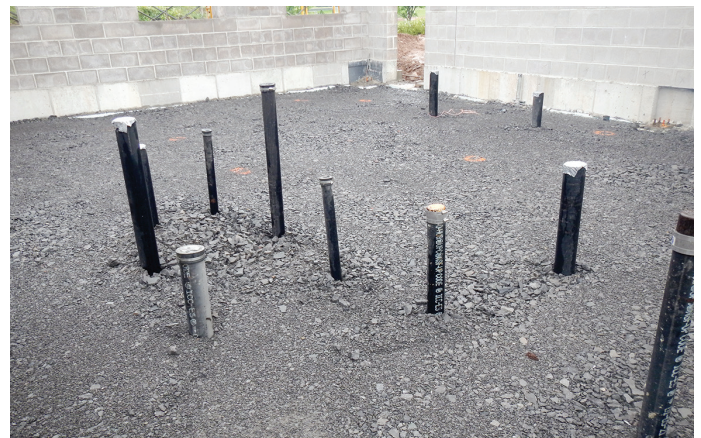
Underground plumbing installed at the west side of the Transportation Building.