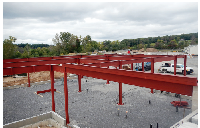
Structural steel at the west side of the Transportation Building.