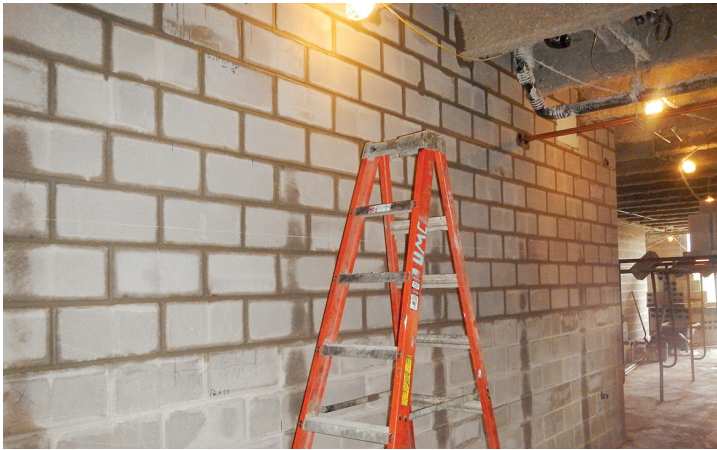
Interior CMU walls being constructed at the High School Team Room Addition.