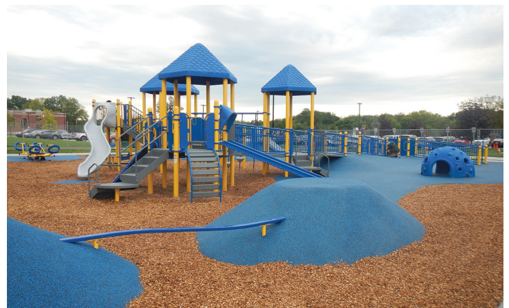
ADA compliant Primary School Playground surfacing and wood chips complete.