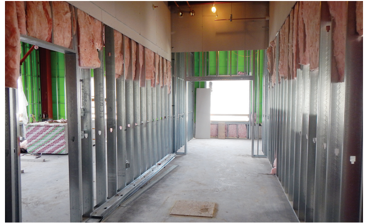
Drywall and insulation on-going at the ECS 2nd floor addition.