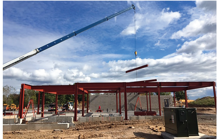
Structural steel erection at the west side of the Transportation Building.