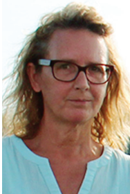
Tracy Tonias Food Services