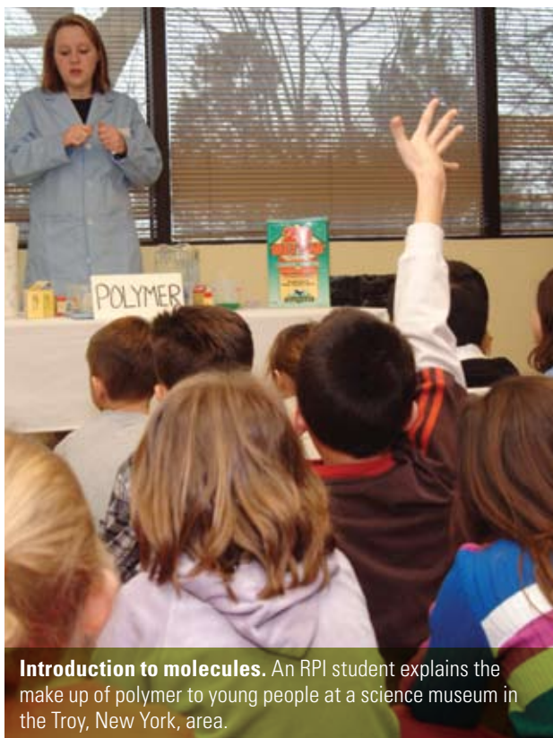
Introduction to molecules. An RPI student explains the make up of polymer to young people at a science museum in the Troy, New York, area.

Through policy forums, issue papers, and annual conferences, the AAAS focused attention on the issue in Washington, D.C., and around the country during the two years of my tenure first as its president (2004) and then as chairman of the board (2005).