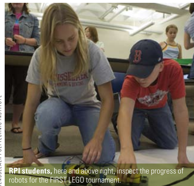
RPI students, here and above right, inspect the progress of robots for the FIRST LEGO tournament.

In urging the Congress and the country to support his call to invest the necessary national resources to put a man on the moon before the end of the decade, in his May 25, 1961, Message to the Congress, President Kennedy said, “I believe we possess all the resources and talents necessary. But the facts of the matter are that we have never made the national decisions or marshaled the national resources required for such