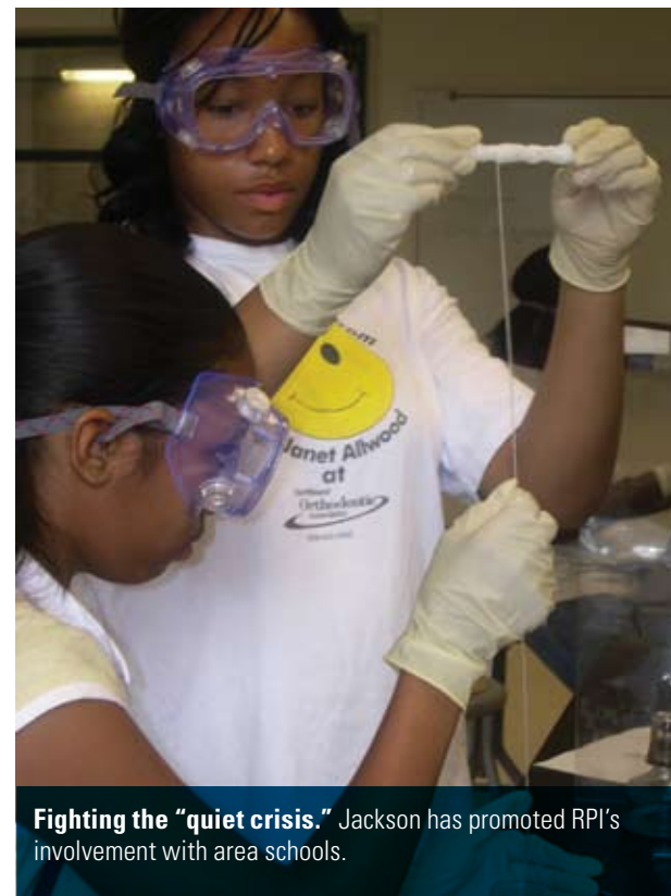
Fighting the "quiet crisis." Jackson has promoted RPI's involvement with area schools.