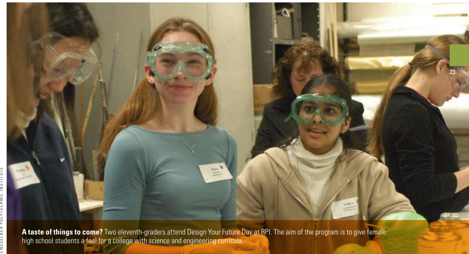
A taste of things to come? Two eleventh-graders attend Design Your Future Day at RPI. The aim of the program is to give female high school students a feel for a college with science and engineering curricula.

years.” They and others have raised concerns about the potential of “severe shortages of qualified workers to maintain the safe and reliable operation of commercial and defense nuclear power plants.” 2