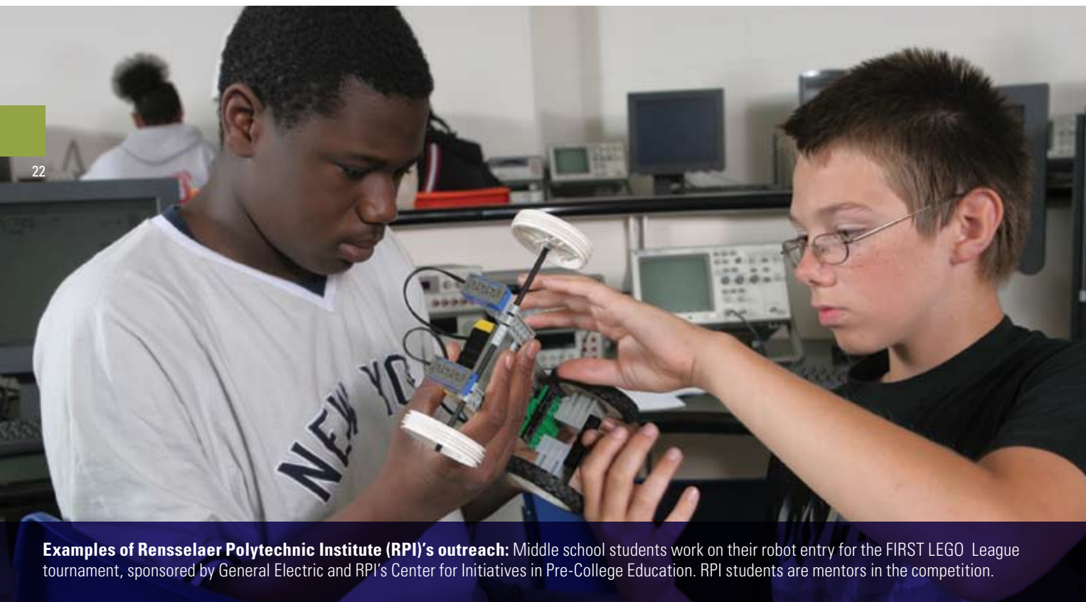
Examples of Rensselaer Polytechnic Institute (RPI)'s outreach: Middle school students work on their robot entry for the FIRST LEGO League tournament, sponsored by General Electric and RPI's Center for Initiatives in Pre-College Education. RPI students are mentors in the competition.

The young American students who responded in record numbers to Kennedy's appeal became the engineers, mathematicians, and scientists who have comprised the backbone of our innovative economy for the last 40 years. Their ingenuity, along with that of the students who came from abroad to study and work in the United States, strengthened our economic and national security for a generation. This generation of researchers, teachers, and inventors explored not only the outer reaches of space but also the inner workings of the human body, the far reaches of the earth, and the new horizons opened through information technologies. In so doing, they have made exponential advances in an extraordinary number of fields including health, communications, and transportation. The advances have changed how long we live, where we live, and the way we live.