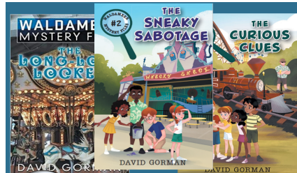
Intermediate Series - chapter books

(Families with more than 1 child can receive a maximum of 2 books)