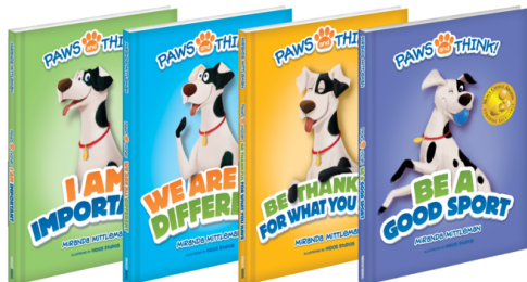
Primary Series - picture books

Please circle which book series you would like to receive