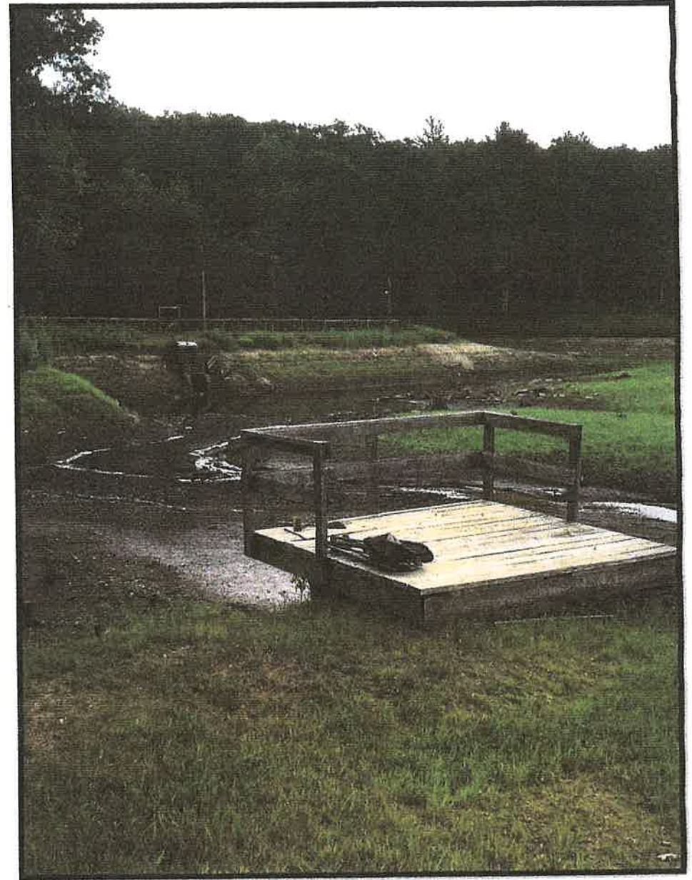
Summer 2020 The earthen dam looks solid from the water side and on the top surface. The outer bank is where shallow sink holes have appeared indicating the internal erosion. A video camera inserted through the valve pipe and sample core borings from the top down have disclosed the sand and gravel content of the interior structure is not the correct material, it does not contain the necessary amount of clay for sustainability.