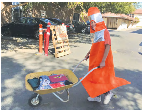
Class Themed Dress Up Days, Freshman

dress-up days, spirit rallies, class competitions, and a homecoming football game and dance. The Spirit Week events, which were coordinated by the Paly ASB,