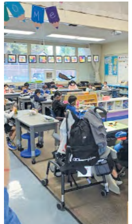
Learning together inclusively