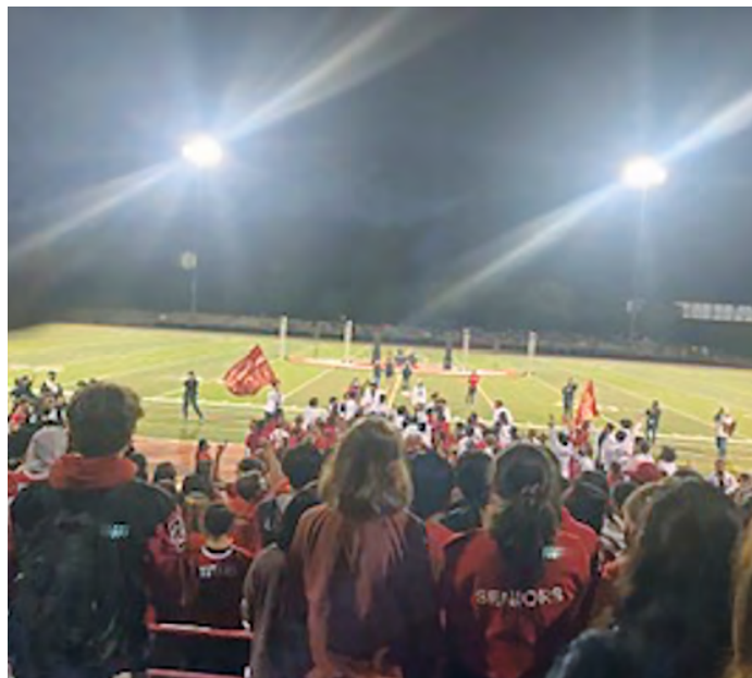
HoCo 2021 at Gunn High! Go Titans!