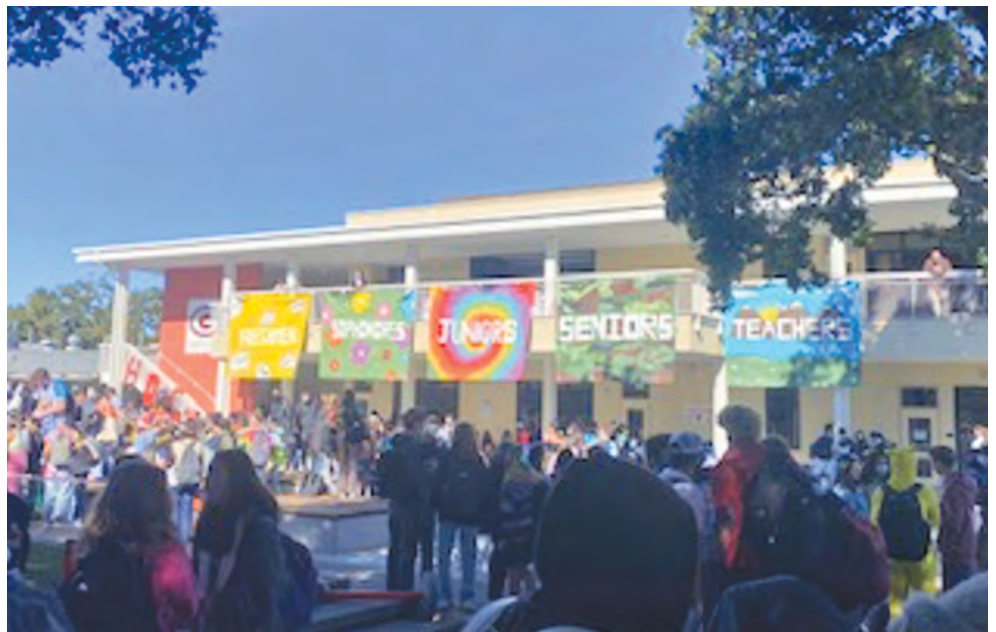
Gunn Quad – HoCo 2021

full of gratitude for every opportunity we are granted to experience community. The photo below provides a glimpse into HoCo 2021 at Gunn High! Go Titans!