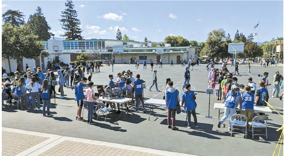
The JLS Panther Association of Leadership and Service (PALS) putting on a Trivia Game at Lunch, October 2021.

comfortable with the new block schedule, but it is getting a little bit easier and smoother each day. As we look forward to increasing our stamina, we also look forward to sharing more experiences (safely) in-person with our friends and families. Go Panthers!