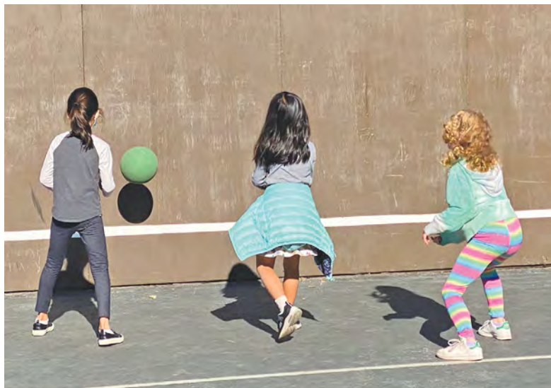
Nixon Dolphins engage in a friendly game of Handball (a.k.a. Wall Ball) during recess.

Nixon families and teachers communicate openly and build strong relationships to support our students. We are here to provide the support and care our students need, and we are incredibly grateful for the support of our amazing community.