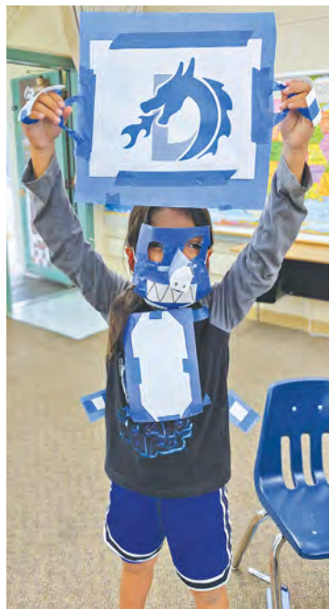
It's great to be a Duveneck Dragon!

There is nothing like a student in front of a teacher in a classroom. Our dedicated group of educators have been exceptional with their efforts assessing current achievement levels during these first months of school. This important data assists with charting a curricular course to meet and exceed the learning opportunities our students deserve. Duveneck educators are a very talented