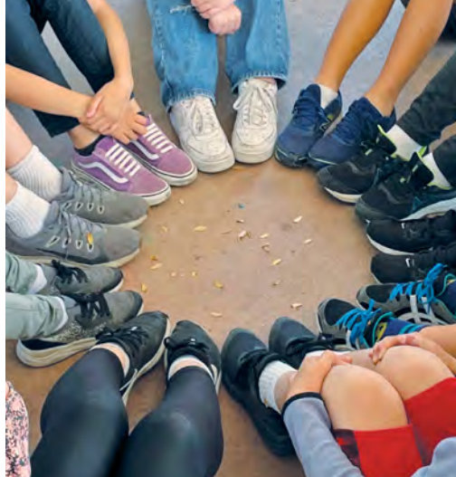
Fletcher Orchestra and Choir students come together again for the Fall Retreat

We jumped right back into school, togetherness, and community-building. All grades were involved in reacquainting with their peers, staff, school buildings, and our school grounds with our first ever 6-8 grade Tiger