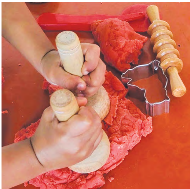
Hands-On Learning at Greendell School