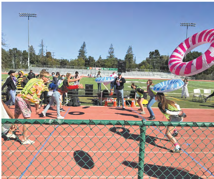
Paly Class Games During Assemblies