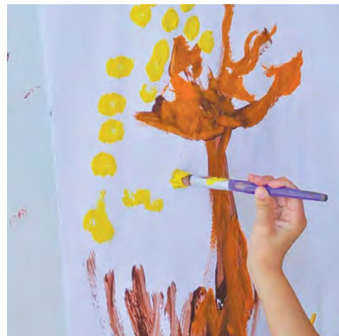
Hands on Learning