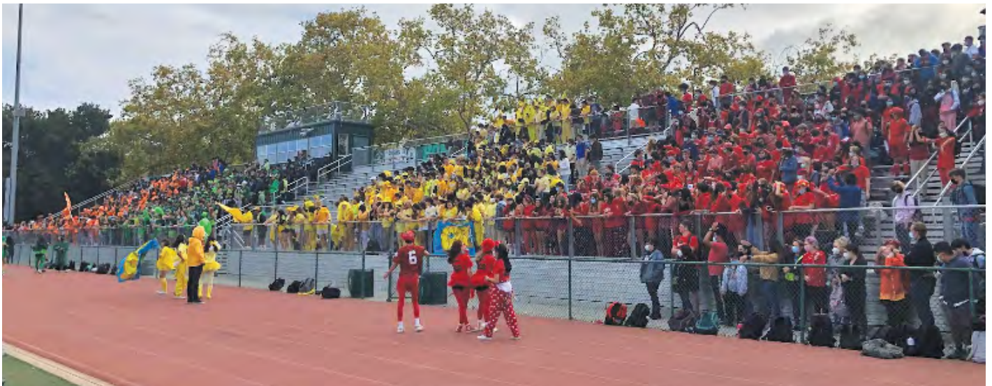
All Together Now --- Class Color Day

is one of the most exciting times of the school year, providing students and staff members with opportunities to come together and make connections with each other outside of the traditional learning environment. By the end of the week, Paly showed to each other that unity and spirit is a Paly tradition that was able to be reignited and embraced by the entire student body and staff.