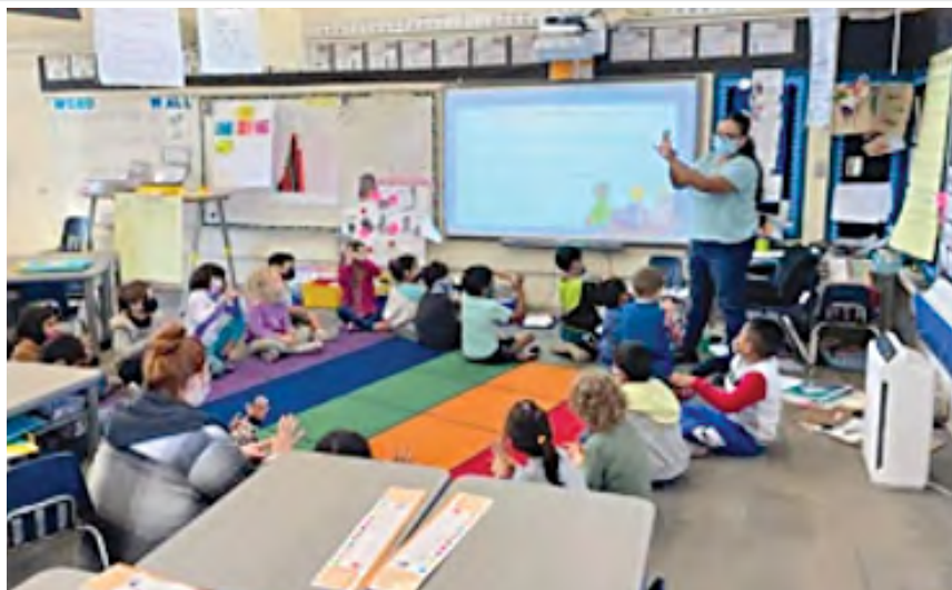
Students gather around the playground for the El Carmelo school community meeting.

In the classrooms, one of the best ways that I see our