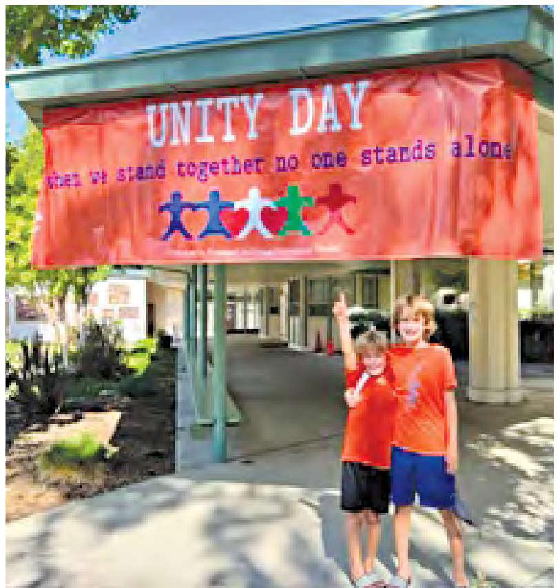
Walter Hays Students celebrate Unity Month!

Thank you, Walter Hays Community! Each of you are amazing people!