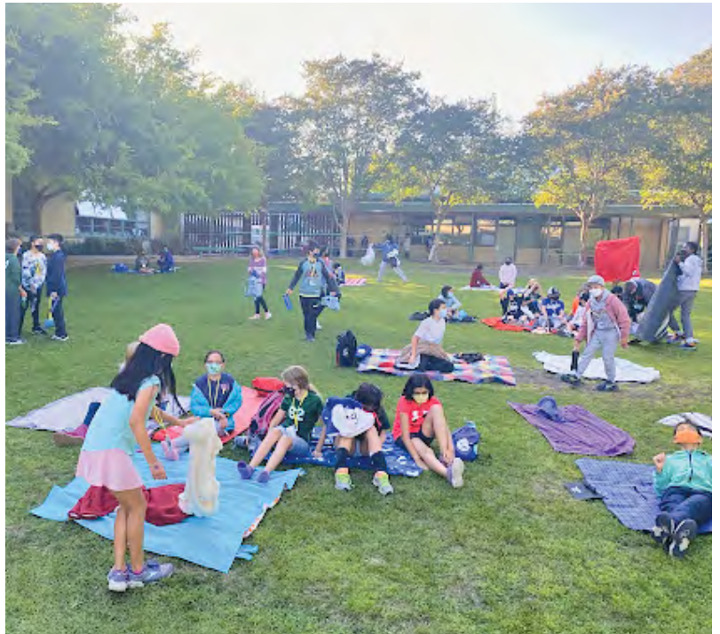
6th graders ready for movie night in Hugh Center Court.

The 7th and 8th Grade Dance was held the following week, with twinkle lights, balloons, streamers, and disco lights transforming our center courtyard. With a fantastic deejay spinning popular tunes, nearly 400 7th and 8th graders danced the night away. With all the experiences these kids lost last year, it was amazing to be back together on campus.