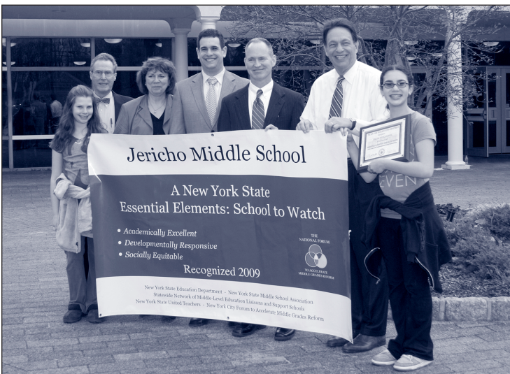
The National Forum to Accelerate Middle Grades Reform has named Jericho Middle School as a "School to Watch," a prestigious designation only garnered by two other middle schools in New York State this year. As a "School to Watch," Jericho Middle School has been recognized for being an exemplary school in terms of academic excellence, developmental responsiveness, social equity, and effective organizational structure and procedures.

In addition to increasing costs that support district programs and facilities, changes in proposed State Aid are expected to create a loss in funding up to $800,000 and the loss of Interest Income Revenue up to $400,000.