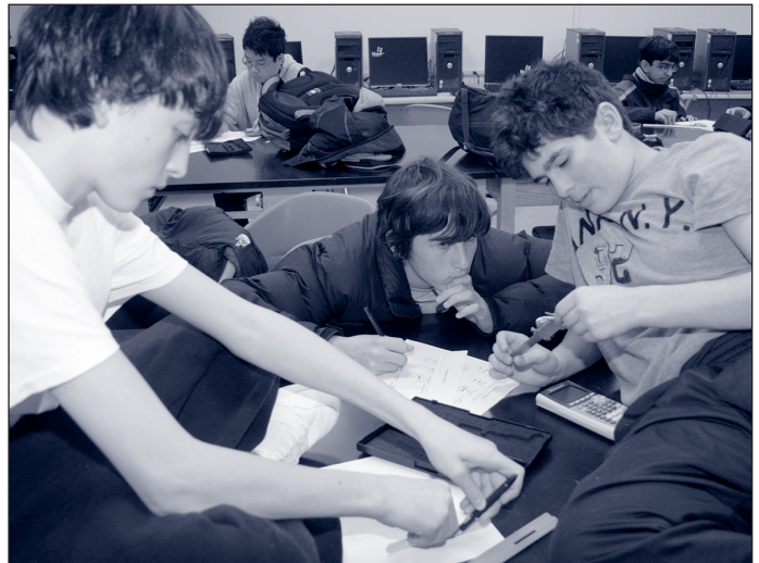
Funding for the expansion of Project Lead the Way, a very successful high school engineering program, is included in the proposed budget. The second sequence, Civil Engineering and Architecture, will be added next year.