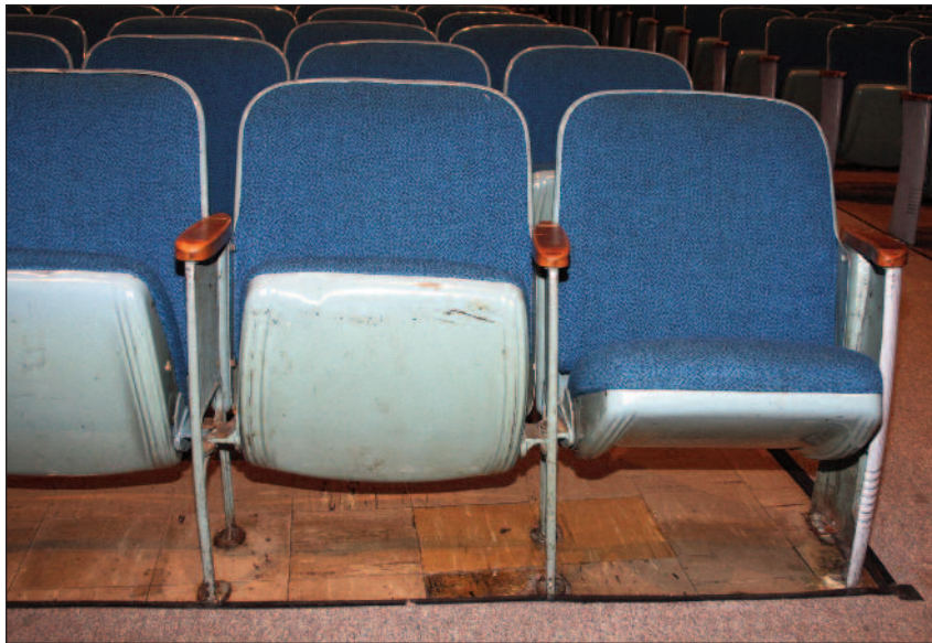
A photo of the current auditorium, showing the need for renovations, including stained and aging asbestos tiles and chairs that are not properly functioning. ▲

Security upgrades include, but are not limited to, video surveillance upgrades, visitor management upgrades, intrusion detection, panic system upgrades, and door security upgrades. Approval of this proposition would have NO additional impact to the budget or tax levy.