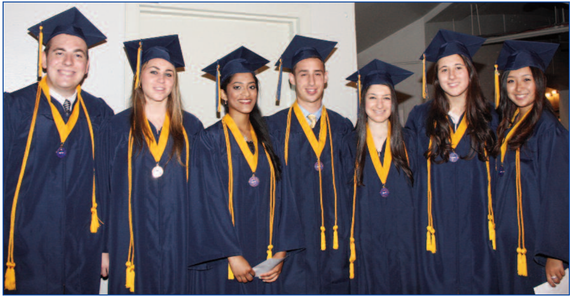
In Jericho High School's class of 2013, 99% of all seniors earned Regents diplomas and 87% received Regents Diplomas Awarded with Distinction. Also, 88% of our graduates completed at least one Advanced Placement course. Jericho's percentages in these categories are among the highest in New York State.