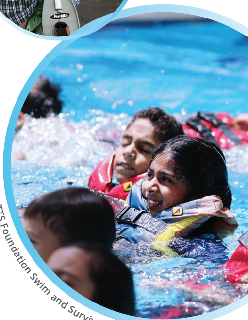
TTS Foundation Swim and Survive programme