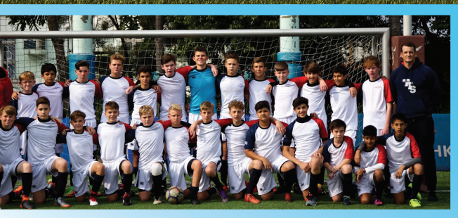
U14 Sports Tour, Hong Kong