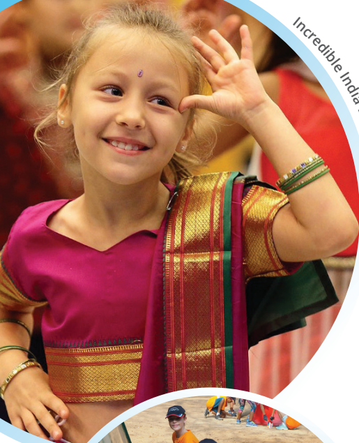
Incredible India Day dance activity