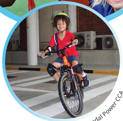
TTS Foundation Pedal Power CCA