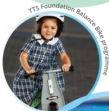
TTS Foundation Balance Bike programme

More details of each of these projects can be found on the TTS Foundation webpage www.tts.edu.sg/welcome/tts-foundation