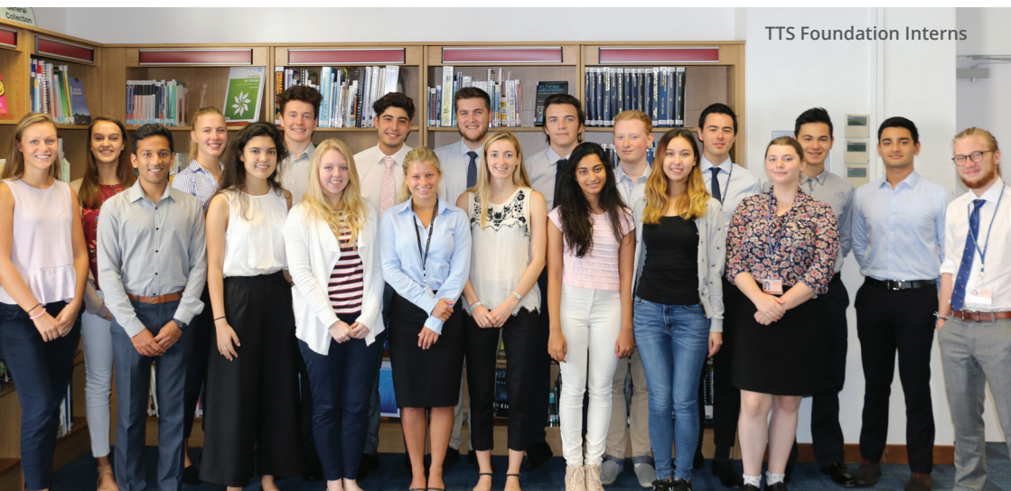
TTS Foundation Interns

More details of each of these projects can be found on the TTS Foundation webpage www.tts.edu.sg/welcome/tts-foundation