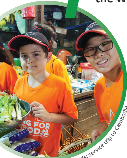
Representative Awards: service trip to Cambodia

Engagement with Global Issues and with the Wider Community