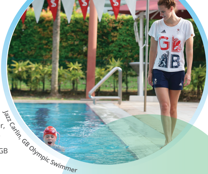
Jazz Carlin, GB Olympic Swimmer