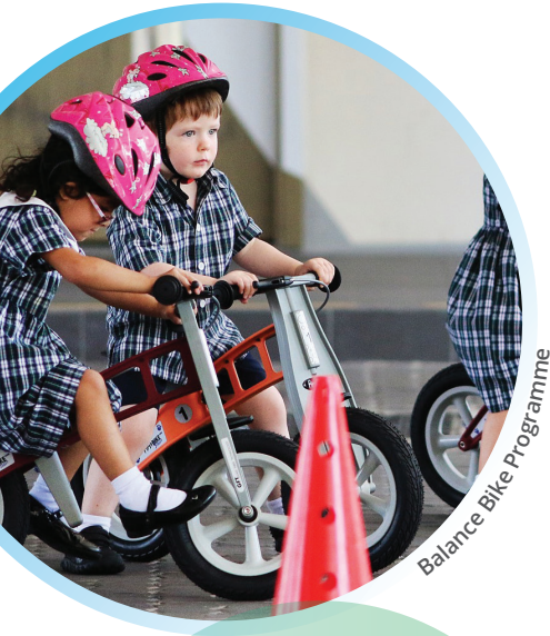
Balance Bike Programme