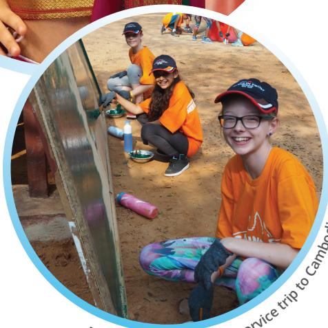
Representative Awards: service trip to Cambodia

“It was quite incredible how you managed to get each and every member of Year 6 involved – and the looks on their faces during the performance and their beaming smiles at the end as they took their bows.” Junior School Parent on Year 6 Shakespeare performance