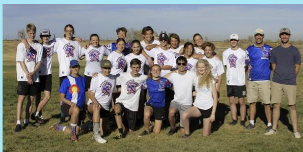
Centaurus Warriors Ultimate, Mixed Team, Fall 2021