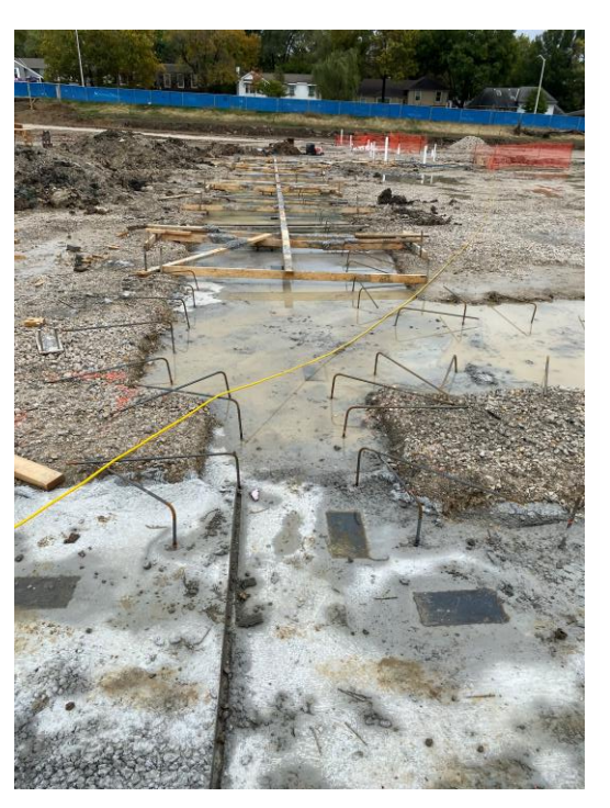
Area C Footings