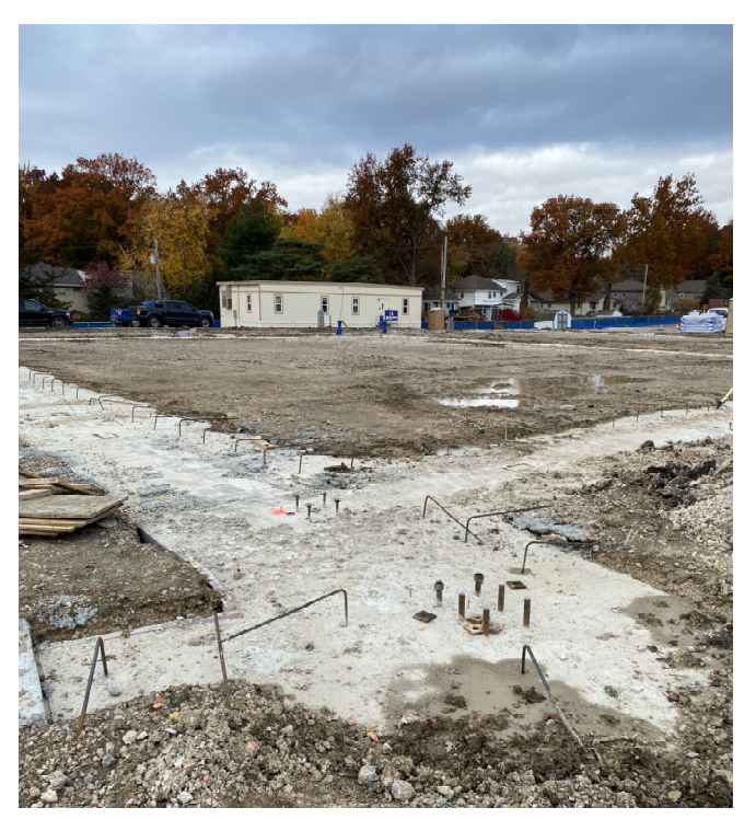
Area C Footings