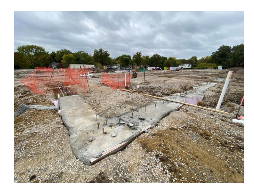
Area B Footings