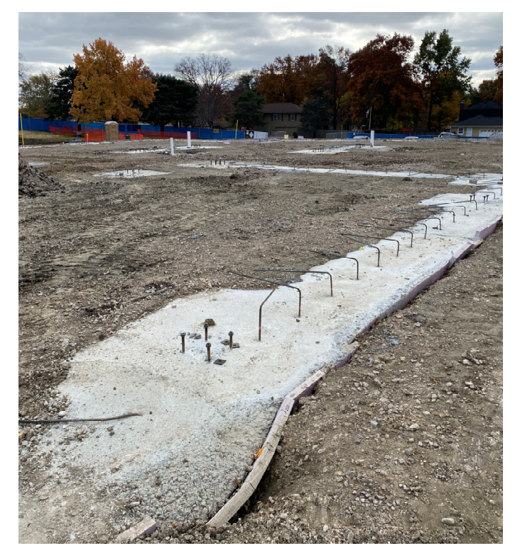
Area A Footings