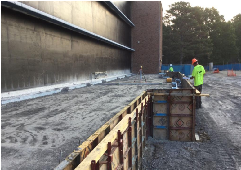
Building Pad Fill