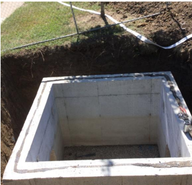
Fire Line Vault