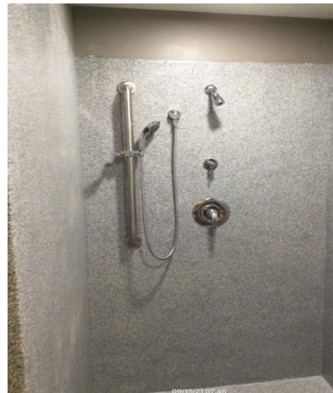
Shower in Toilet 121