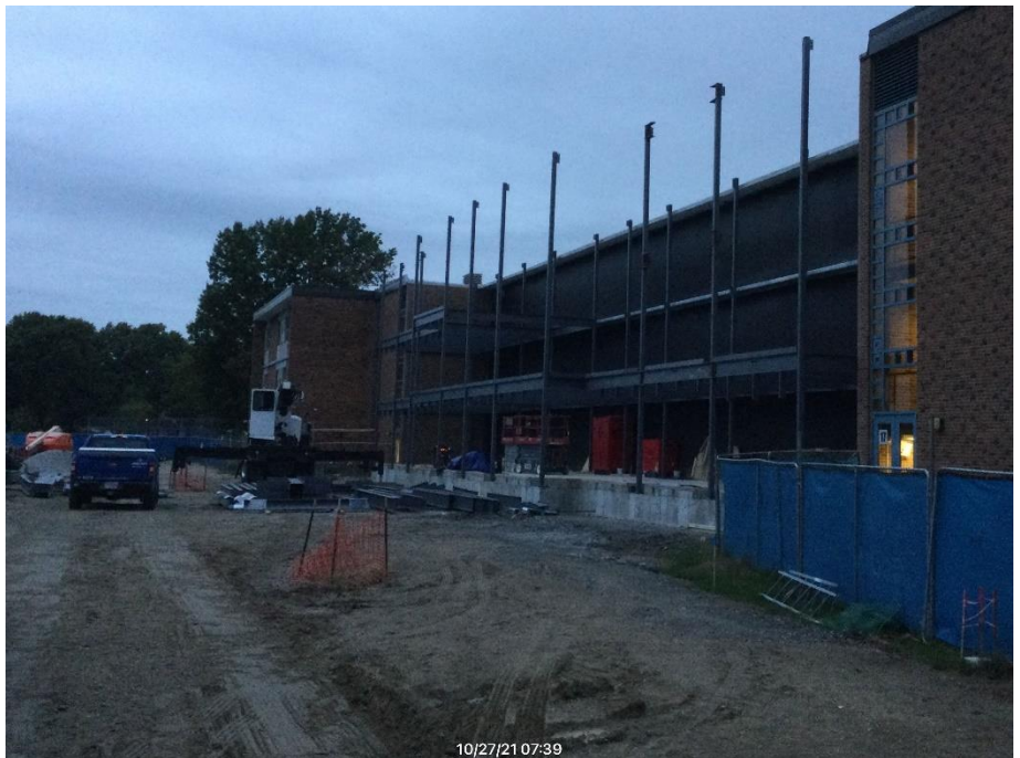
Steel Column Installation