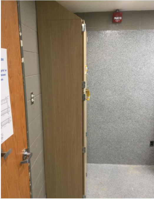
Locker in Toilet 121