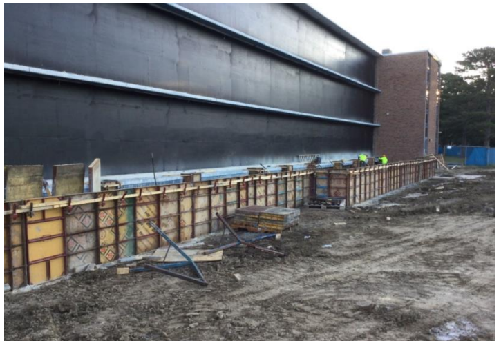
Stem Wall Formwork