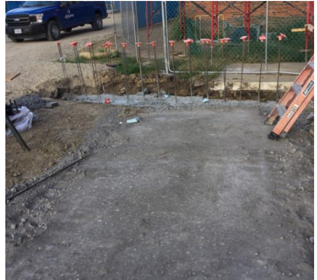
Retaining Wall Footing