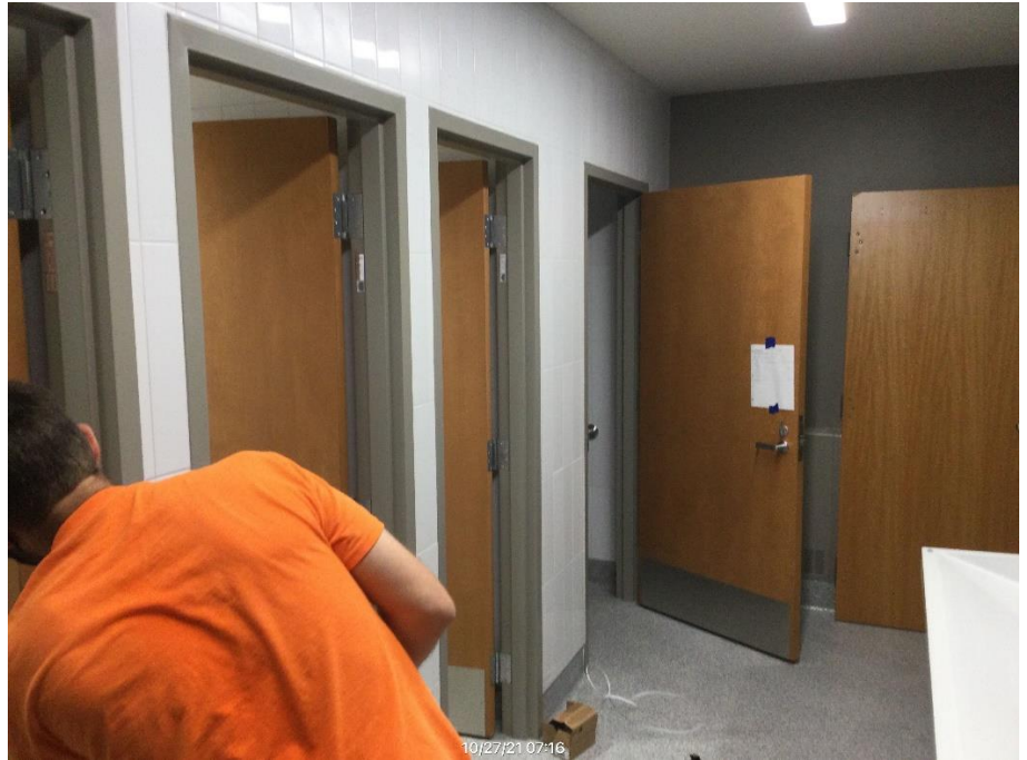
Door and Hardware Installation