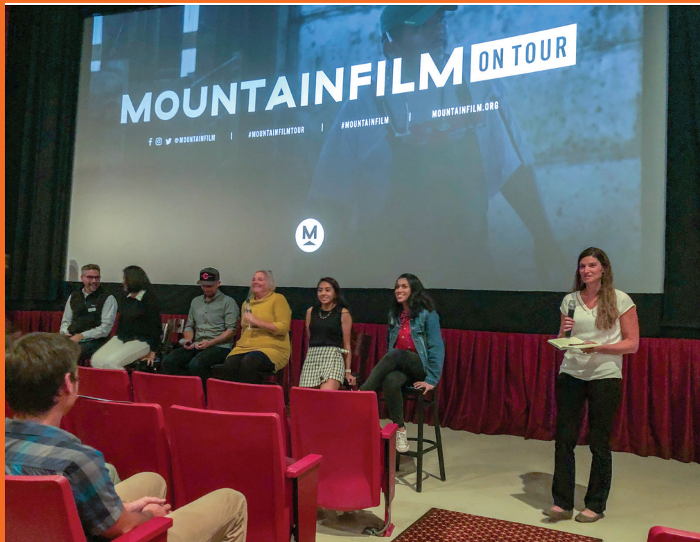
Panel discussion after community screening of films showcasing diverse cultures