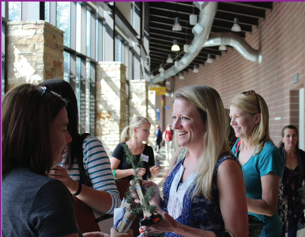
Educator Academy kicks off the school year.