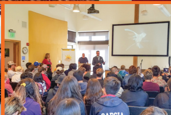
High school student viewing Mountain Film on Tour and Y.E.S. materials and student training.