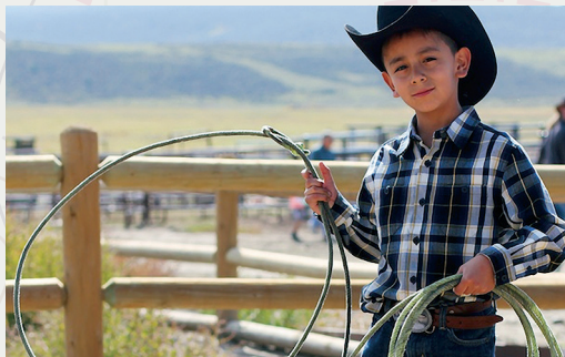
Wild West Day

And that's not all. Wild West Day raises money for elementary PTAs. Project Funway funds grants and Apple Awards, a $500 gift to an educator each month. Dancing with the Stars raises hundreds of thousands of dollars for the Vail Valley Foundation, which supports students in our valley. Vail Health helps fund Project Lead the Way by purchasing STEM-based project materials. SOS Outreach, Walking Mountains Science Center, Cycle Effect, Mountain Rec – we have over 200 non-profits help support causes in our community.