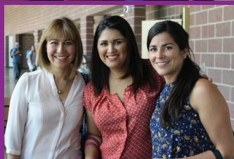
Small group break out sessions.