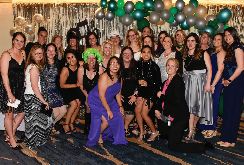
Evening of Stars