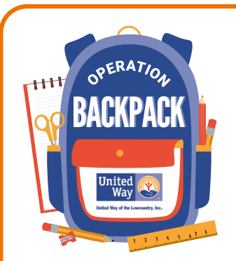
1,000+ Local students received school supplies through Operation Backpack

Assisting our neighbors impacted financially by COVID-19