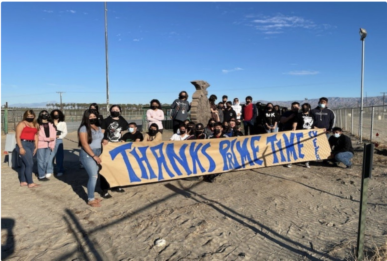
CVHS FFA at the Indio BBQ Festival