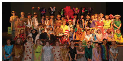
Middle school students across the district brought the magic of Dr. Seuss to life in the musical production of "Seussical Jr." NISD's talented students awed audiences with elaborate scenes and characters, including Cat in the Hat, Horton the elephant, and Gertrude McFuzz.

From Scrabble to robotics, if a child has an interest, there is most likely an organization in Northwest ISD schools that helps promote and support that interest. NISD is dedicated to providing students a premier education, preparing them for the future. In Northwest ISD, students are encouraged to not only take advantage of rigorous real-world curriculum and hands-on career pathways, but also extracurricular activities.