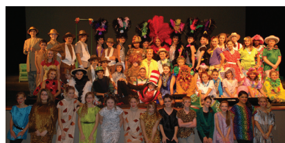
Middle school students across the district brought the magic of Dr. Seuss to life in the musical production of "Seussical Jr." NISD's talented students awed audiences with elaborate scenes and characters, including Cat in the Hat, Horton the elephant, and Gertrude McFuzz.

From Scrabble to robotics, if a child has an interest, there is most likely an organization in Northwest ISD schools that helps promote and support that interest. NISD is dedicated to providing students a premier education, preparing them for the future. In Northwest ISD, students are encouraged to not only take advantage of rigorous real-world curriculum and hands-on career pathways, but also extracurricular activities.