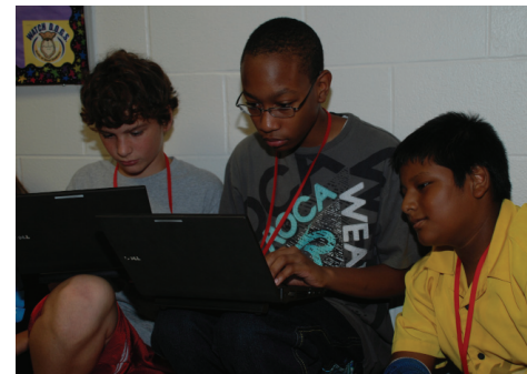
Gene Pike Middle School students explore the netbooks. With the district-issued equipment, students can work on school projects and enhance their learning almost anywhere at any time.

District officials believe the netbooks, a Dell Latitude 21 series, provide equal opportunities in preparing students for a digital age and increase student engagement.