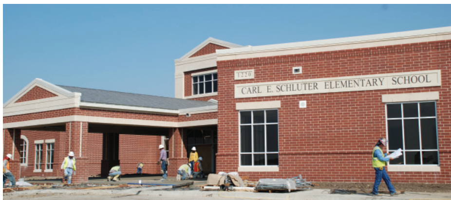
Crews continue work on Carl E. Schluter Elementary School, one of two new campuses that Northwest ISD will open in time for school to start on August 23. Faced with increased student enrollment throughout the district, new buildings allow Northwest ISD to meet the needs of its rapidly-growing communities.

To support the continued development and enrollment in Northwest ISD (NISD), the district will open two new elementary schools in August: Carl E. Schluter Elementary School and J.C. Thompson Elementary School.