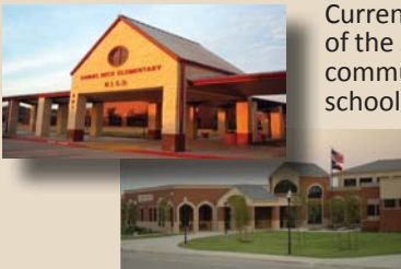
Construction will begin in 2012 at Beck, Granger, and Roanoke to expand the capacity of each of these schools.

Currently, the ideal building capacity of NISD elementary schools is either 450 or 650, depending on the design of the school and when it was built. In October, the NISD Long Range Planning Committee, made up of parents, community members, teachers and administrators, recommended an increase to the capacity of elementary schools, and the Northwest ISD Board of Trustees has since re-established the optimal capacity of elementary schools. Schools designed for 450 students will be increased to a 650-student capacity, and elementary schools designed for 650 will increase to 850, beginning with the 2012-2013 school year. With an increased elementary school capacity, another new elementary school is not needed until approximately 2015. Instead, nine elementary schools will receive building additions over the next five years. This will save the district more than $3 million in operational costs. Building additions will begin after January 2012 at Samuel Beck, Kay Granger and Roanoke elementary schools. Kay Granger and Roanoke elementary schools will start the 2012-2013 school year with a new capacity of 850 students and the Samuel Beck Elementary School student capacity will change to 650 students. Although the student capacity will have changed, the buildings will not necessarily meet full capacity in the first year of the change.