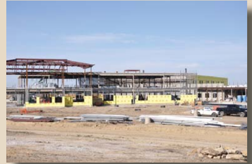
Construction is approximately 50 percent complete on Wilson Middle School, on schedule to open this August.

Families who live in the attendance zones for Nance and Schluter elementary schools are still zoned to attend Chisholm Trail Middle School. The Wilson Middle School attendance boundary was based on a recommendation by the Northwest ISD administration and a parent advisory committee. Serving on the advisory committee were parents from the following schools: Chisholm Trail and Pike middle schools, as well as Sendera Ranch, Thompson, Haslet, Nance and Schluter elementary schools. The attendance boundaries for Medlin and Tidwell middle schools are not affected and therefore remain the same as 2011-2012.